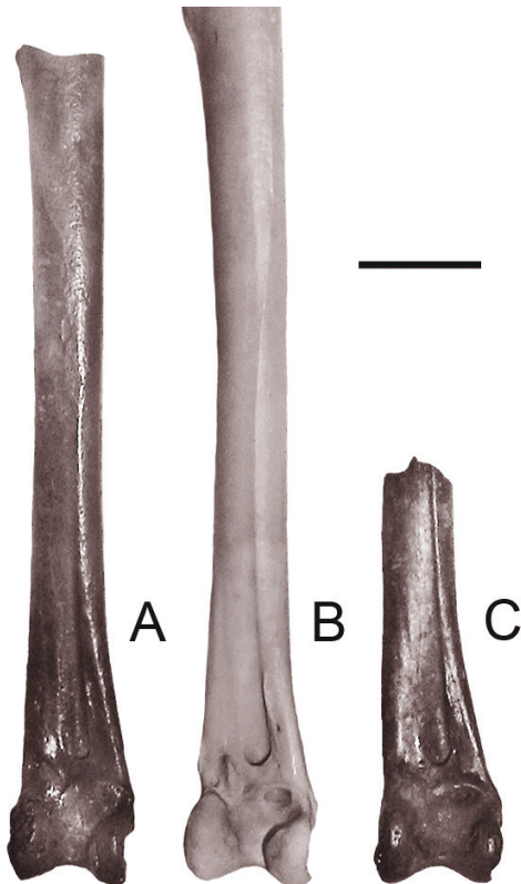
Figure 2. Right tibiotarsi (A–C, anterior view) in two species of the genus Cathartes . C. emslii : paratype MNHNCu 75.4750 (A), paratype MNHNCu 75.4749 (C); and C. burrovianus : USNM 622341 (B). Scale = 1 cm