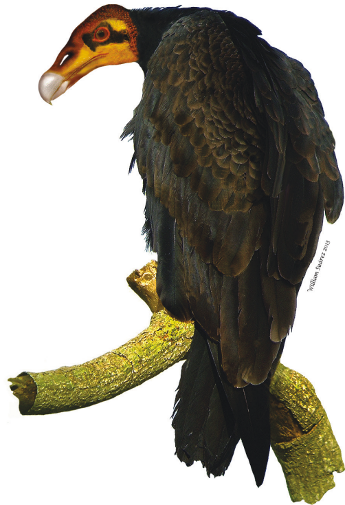
Figure 4. Hypothetical reconstruction of Emslie's Vulture Cathartes emsliei