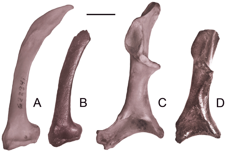
Figure 1. Right scapulas (A–B, ventral view) and left coracoids (C–D, dorsal view) in two species of the genus Cathartes . C. burrovianus : USNM 622341 (A, C); C. emslii : paratype MNHNCu 75.692 (B); paratype MNHNCu 75.4755 (D). Scale = 1 cm (William Suárez)