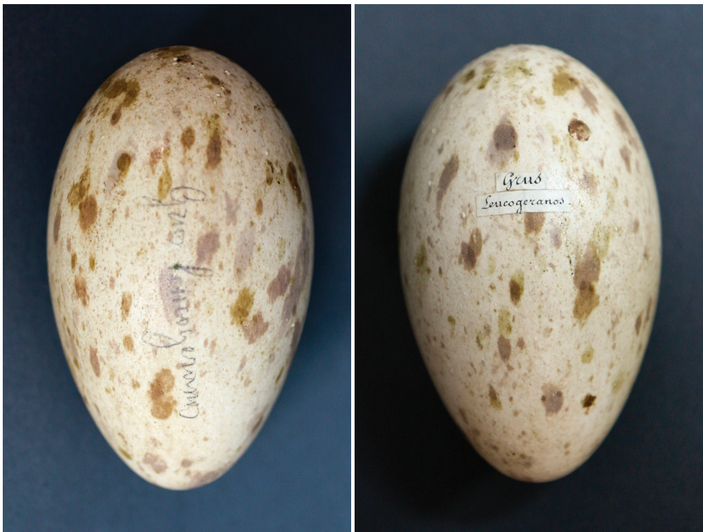
Figure 1. Egg of Siberian Crane Leucogeranus leucogeranus (MDLV.2015.0.4) showing the two different inscriptions

On his return from the North Cape in 1890, Chabrand made a short stopover in St. Petersburg (24–27 July) and Moscow (28–30 July). During his travels Chabrand frequently visited museums and sometimes met their directors or curators (Homps 2010). He visited the 'Parc zoologique' of St. Petersburg (probably what is now the St. Petersburg Zoo)