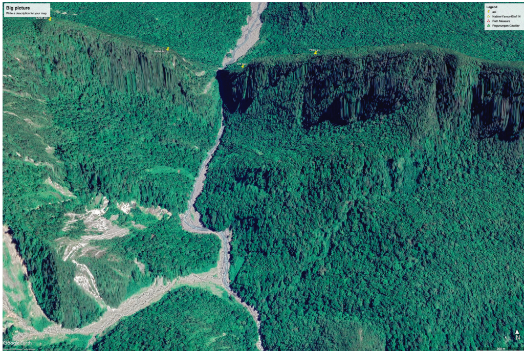
Figure 3. Google Earth close-up view, from the south, of the east / west ridge closing to the north the basin viewed in Fig. 2. The ridge has near-vertical southern and northern faces, and is pierced by the basin's stream via a cleft only c.20 m wide.

establish populations. We note that only eight of those 33 are species regularly observed to fly high above the forest canopy. Most of the rest inhabit the forest interior. We would not expect Goura pigeons, Yellow-bellied Gerygone, King Bird of Paradise, Spot-winged Monarch Symposiachrus guttula or Black-sided Robin Poecilodryas hypoleuca to ascend high vertical cliff faces, or to fly through a long narrow tunnel over a mountain torrent. But those 33 lowland species faced no such significant obstacles in traversing the gradually sloping foothills of the Van Rees Mts. to reach our transect thereon.