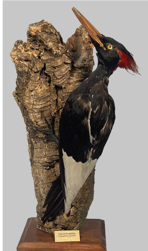
Figure 3. Male Imperial Woodpecker Campephilus imperialis in the North Museum of Nature and Science in Lancaster, Pennsylvania (NMNSL-689)