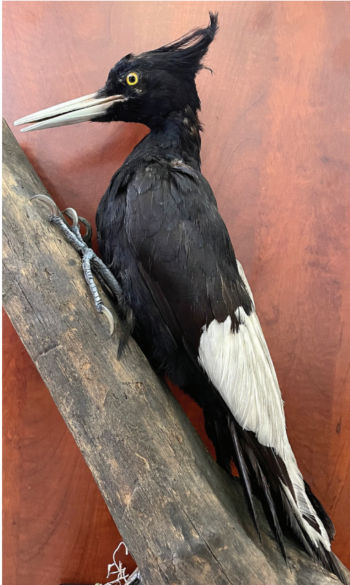
Figure 2. Female Imperial Woodpecker Campephilus imperialis in the Miami County Museum in Peru, Indiana (MCM-1919.021.0033.2); previously misidentified as Ivory-billed Woodpecker C. principalis