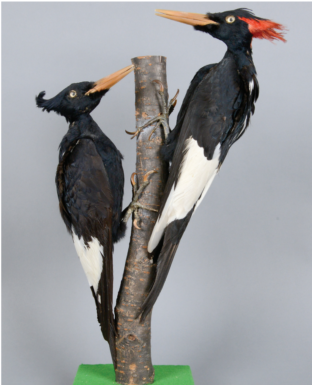
Figure 1. Mounted pair of Imperial Woodpeckers Campephilus imperialis collected by Carl Lumholtz around New Year 1890–91, at the Sonora / Chihuahua border; male NHMO-BI-62037; female NHMO-BI-62038

As the piece of skin, based on its appearance, could be from an Ivory-billed Woodpecker Campephilus principalis , it was subjected to a genetic barcoding analysis. DNA from a small tissue sample was extracted in replicate in the sensi-lab at the NHMO DNA lab using DNeasy Blood and Tissue kit (Qiagen), followed by amplification in replicates and sequencing of a 287 base pair fragment of cytochrome C oxidase subunit I. Both PCR and sequencing primers were Minibar-mod-f 5'- TCC ACT AAT CAC AAA GAY ATY GGY