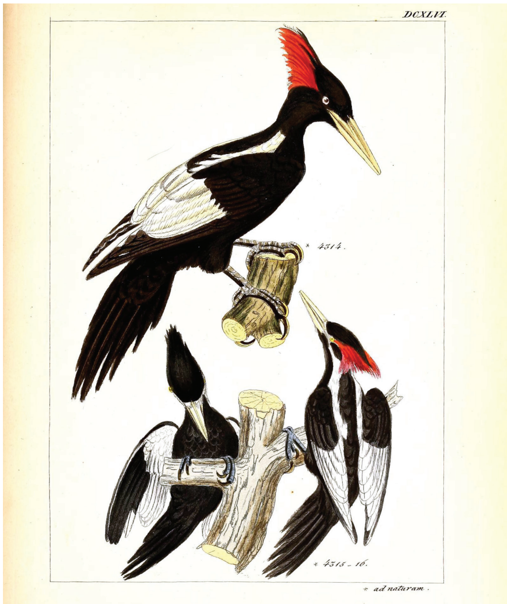
Figure 4. Pl. DCXLVI from Reichenbach (1854), depicting in the upper half (no. 4314) the possible syntype once held in the Staatliches Museum für Tierkunde in Dresden

were also recorded as originating from 'California', despite Bolaños in Jalisco, Mexico, being the species' probable type locality (Nelson 1898, Brown & Clark 2009: 68–69, Prýs-Jones 2011). Perhaps this is just an example of vague knowledge of American geography at the time, as suggested by Nelson (1898). Another possibility, also mentioned by Prýs-Jones (2011), is that the specimens might have been shipped from or through (Baja) California. Shipping ports have become de facto type locations in the past (Turner 2011, Black 2013), so this hypothesis is quite plausible.