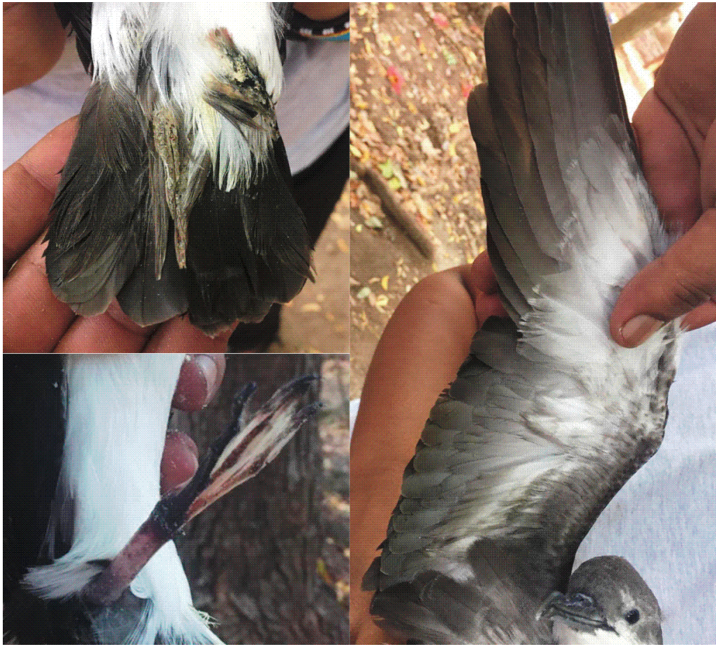
Figure 3. Persian Shearwater Puffinus persicus persicus , Diani, coastal Kenya, 26 February 2019, before it died

2. Puffinus persicus ; 14 March 2009 onshore at Emayani Beach Lodge, near Pangani, north-east Tanzania: plumage (flight feathers and tail) heavily worn but some body feathers (axillaries) fresh (Fig. 4). A beached bird 9 km south of Pangani, which was released alive, can be confidently referred to this species (Fig. 4) by the distinctive dusky underwings and axillaries, eliminating Tropical Shearwater. Additionally, dark undertail-coverts, an indistinct whitish spot in front of the eye, and rather brownish-black upperparts also support identification as Persian Shearwater. The absence of brown flank streaks or pale streaking behind the eye, albeit consistent with some nominate persicus , does not permit elimination of temptator , and therefore we leave this individual unassigned to subspecies.