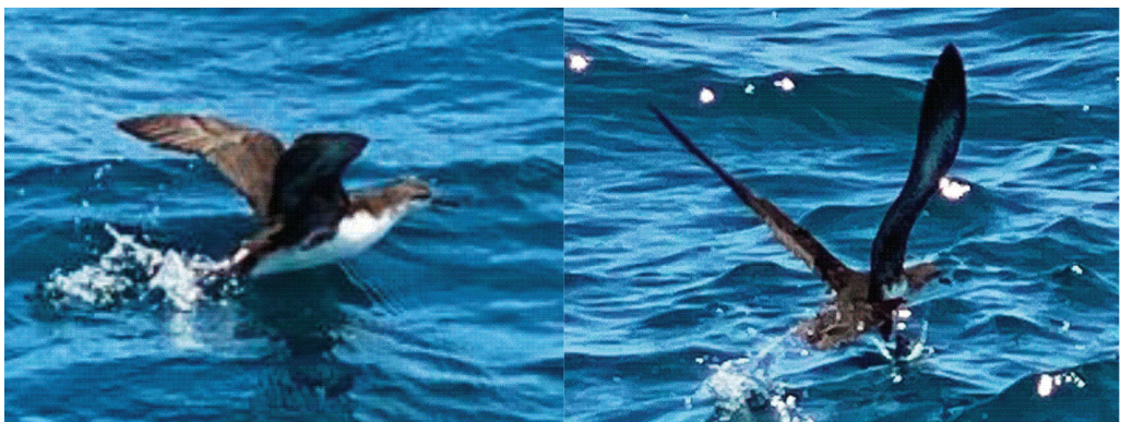
Figure 5. Persian Shearwater Puffinus persicus persicus , off Watamu, coastal Kenya, 1 March 2022, showing the characteristic brown-toned upperparts, much-reduced white in the underwing-coverts, dusky axillaries and brown flanks streaking of this taxon (Jaap Gijbetsen)