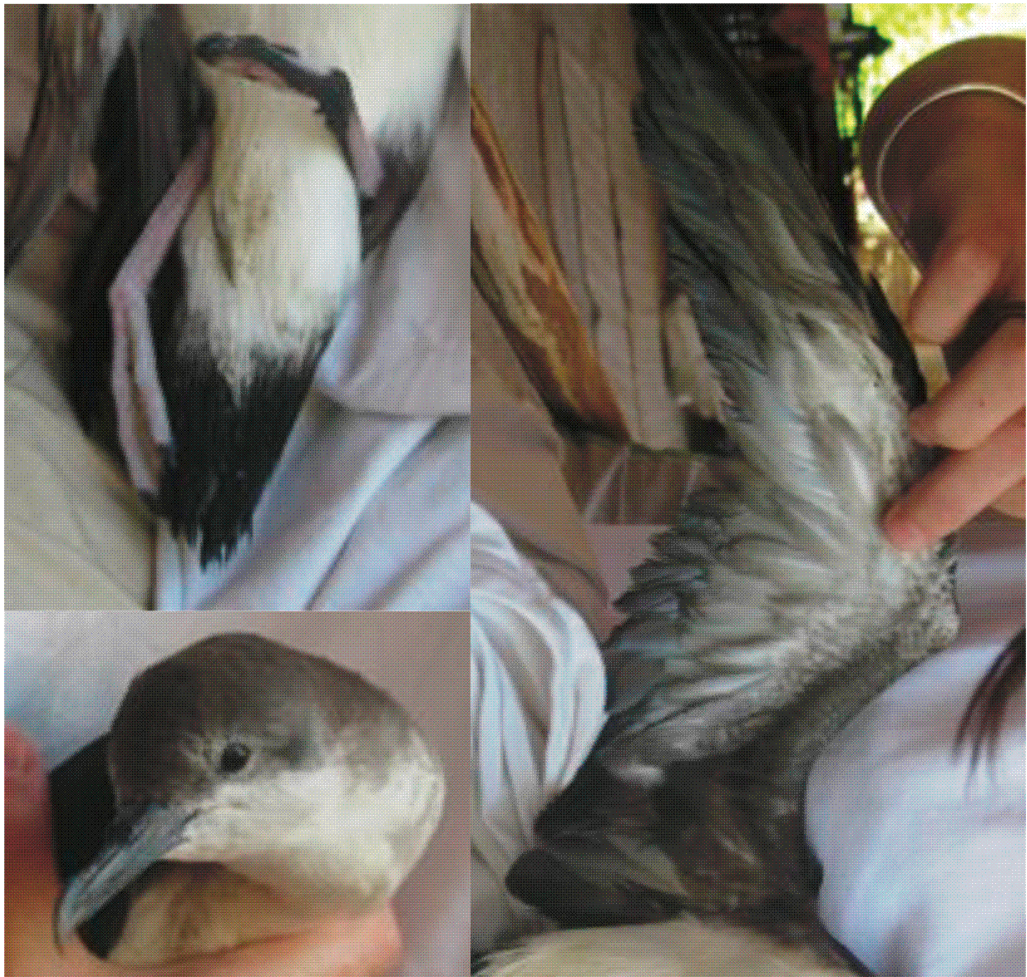
Figure 4. Persian Shearwater Puffinus persicus , ashore near Pangani, north-east Tanzania, 14 March 2009, showing the characteristic dusky underwing, axillaries, and faint white spot in front of the eye