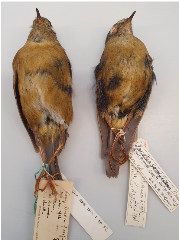
Figure 2. Female syntypes of Ianthia goodfellowi (a synonym of White-browed Bush Robin T. indicus formosanus) (NHMUK 1913.1.29.52; left; for collection details, see main text) and Collared Bush Robin Tarsiger johnstoniae (NHMUK 1907.12.12.40; for collection details, see Fig. 1), showing their identically coloured undertail-coverts