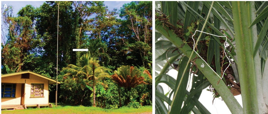
Figure 1. Habitat of Sulphur-rumped Tanager Heterospingus rubrifrons and nest site at Veragua Rainforest Reserve, Costa Rica: (A) the white arrow indicates the height of the nest in the Adonidia merrillii palm; (B) close-up of the nest in the palm frond, the white line represents the location of nest cup, the excess of material left of this and above the palm frond is the nest 'tail'