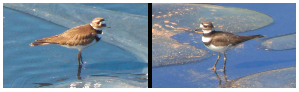
Figure 2. Killdeer Charadrius vociferus , municipality of Ceará-Mirim, Rio Grande do Norte, Brazil, 18 April 2022

In addition to the state checklist for Rio Grande do Norte (Sagot-Martin et al. 2020) and the references mentioned above, I have also found no suggestion that Killdeer has occurred in Brazil in the citizen science websites, eBird (https://ebird.org; as of 18 March 2024), Xenocanto (https://xeno-canto.org; 20 October 2023), Wikiaves (https://www.wikiaves.com.br; 20 October 2023) and iNaturalist (https://www.inaturalist.org; 18 March 2024). Mine therefore is the first record in Brazil and the southernmost on the Atlantic coast of South America. The closest geographical report of the species is in French Guiana, c. 2,300 km to north-west, an undocumented (i.e. hypothetical) record in 2009 (Claessens 2017).