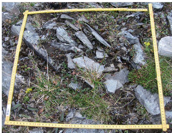
Figure 2. The 0.25-m 2 field plot with Campylopus longicuspis on Mt Pältsa in northernmost Sweden.