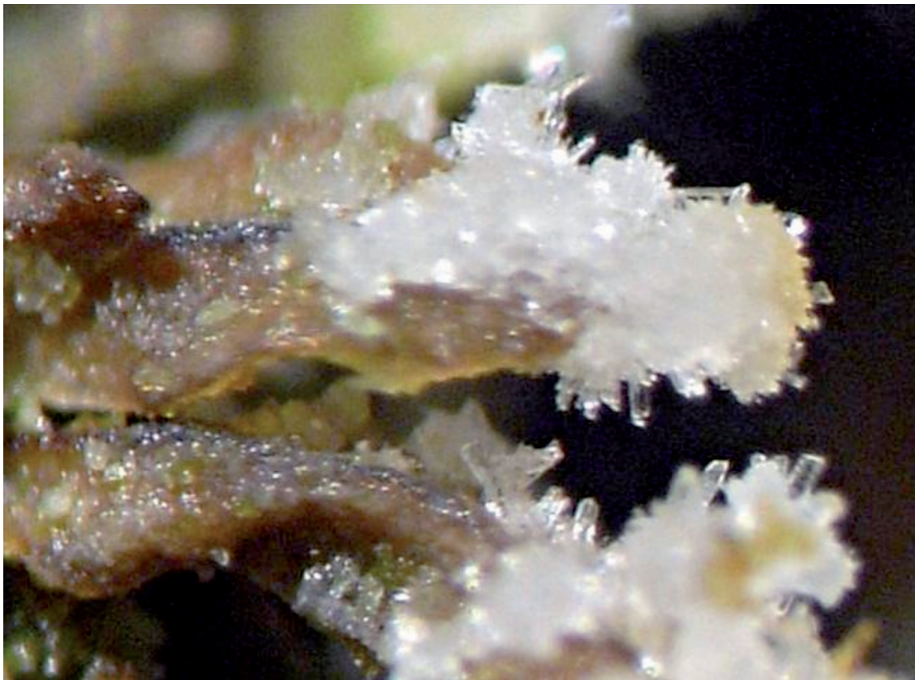
Figure 6. Crystals covering leaf tips of Scopelophila ligulata .