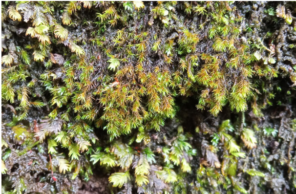
Figure 2. Blindia acuta (Hedw.) Bruch & Schimp. and Fissidens dubius P. Beauv. on schist outcrop (Jalhay, Belgium, 25 June 2022).