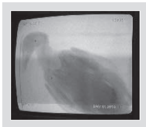
Figure 2. Standard airport security X-ray equipment was used to identify embedded shot. This common eider carries one pellet in the head and one in the breast muscle.

A total of 993 birds, i.e. 879 common and 114 king eiders, were examined for embedded lead shot by either passing them (N = 764 birds) through an airport security check X-ray device (Schlumberger Controlix 2E) at Nuuk Airport with parallel colour and B/W monitors connected, or by taking high resolution X-ray photographs (35 × 40 cm) at the local hospital in Nuuk (N = 229). The first method was applied to most drowned birds, whereas the latter method was used to safely distinguish between embedded shot and the larger pellets used to collect some samples. To verify the ability of the airport X-ray equipment to detect pellets, a sample of 10 birds with lead shot was inspected using both methods. The number of pellets in each carrier was counted, and in case more than one size of lead pellets could be identified (disregarding the large pellets used in sampling some of the birds) the number of each pellet size was recorded. For the wounded birds, notes were taken on the approximate position of the pellet(s), i.e. in the body, head, wings, legs or rump (Fig. 2).