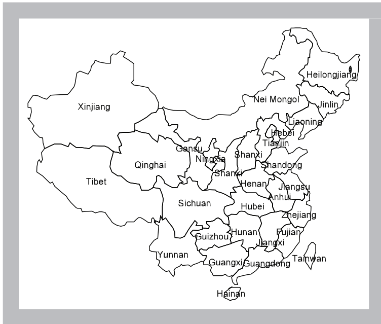
Figure 1. Location of the Wupao Forest Farm in the Wandashan Mountains, the province of Heilongjiang, northeastern China.

cold winters and short hot summers. Annual average temperature is 2.2°C, and extreme temperatures range within -34.8°C - 34.6°C. Average annual precipitation ranges within 500-800 mm. The frost-free period is 120 days, and it lasts from late April to late September. Snow accumulates in late November, persists until end of April, and total snowfall averages approximately 40 cm.