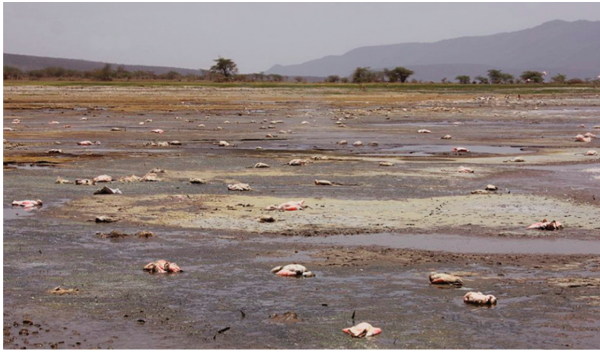
Figure 1. Flamingo die-off at the shore of Lake Bogoria in July 2008. Within one week, about 30 000 out of 150 000 flamingos died.

(Nakuru) and Ramsar site (Bogoria). The surface area of L. Nakuru (00°S, 36°E; 1756 m a.s.l.) between 36 and 49 km 2 depends on precipitation, evaporation and human use such as irrigation and varies highly throughout the year. The lake has a maximum depth of about 1 m and is daily mixed. The surface area of L. Bogoria (00°N, 36°E; 990 m a.s.l.) is usually about 34 km 2 , but extending during distinct rainy seasons especially in the northern area. With a maximum depth of 10.2 m (Hickley et al. 2003), it is stratified over longer periods (McCall 2010).