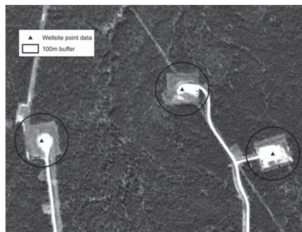
Figure 2. Oil and gas wellsites, wellsite point data, and 100 m buffer distance used for selection analysis.

The analysis of grizzly bear use of wellsites included all use and available locations for each individual bear. From this dataset, any use and available locations classified as ‘wellsite’ locations were carried forward into the analysis of factors influencing wellsite use by bears. Across all seasons, 3155 bear locations and 5546 available locations were within