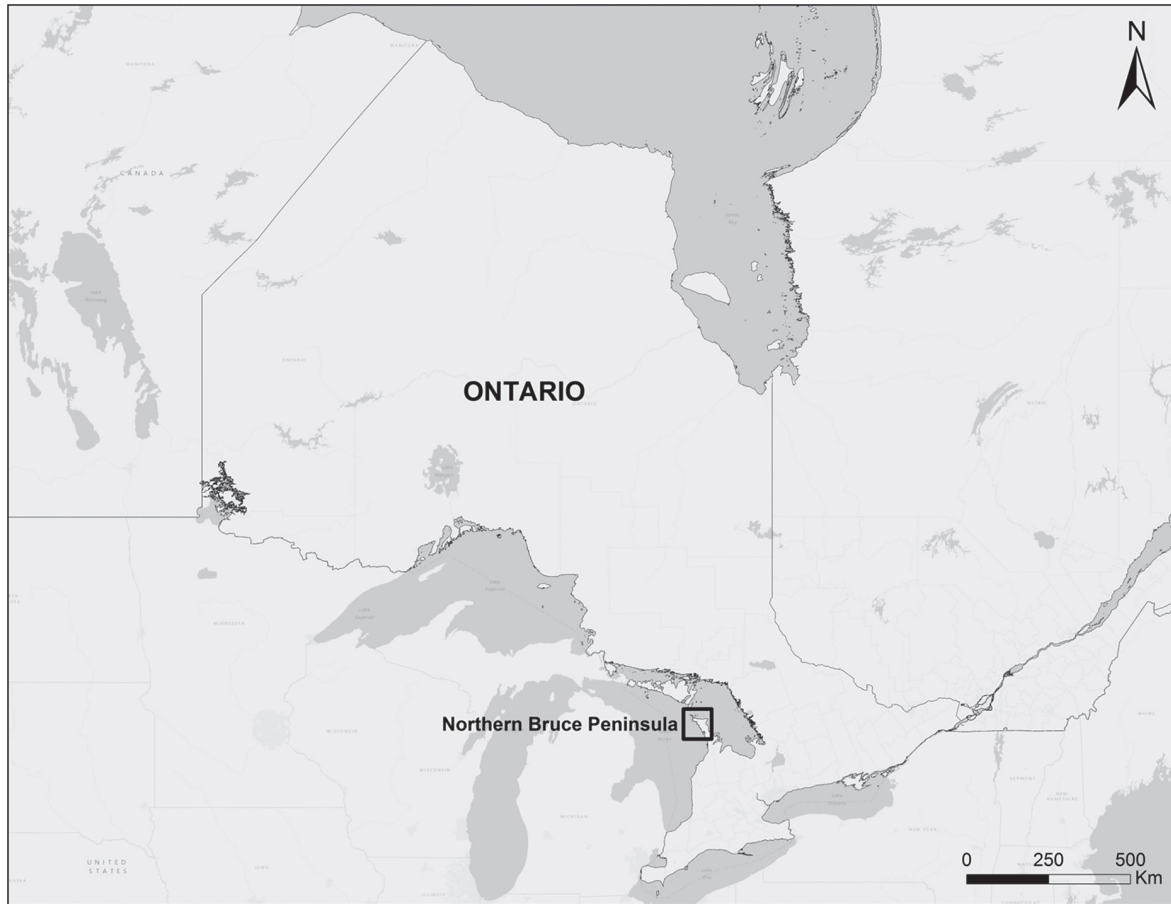
Figure 1. The Northern Bruce Peninsula study area in Ontario, Canada for the wild turkey Meleagris gallopavo research project during 2012–2013 (45°09'N, 81°40'W).

because large tracts of the study area were classified as undifferentiated (Ontario Ministry of Natural Resources 2008).