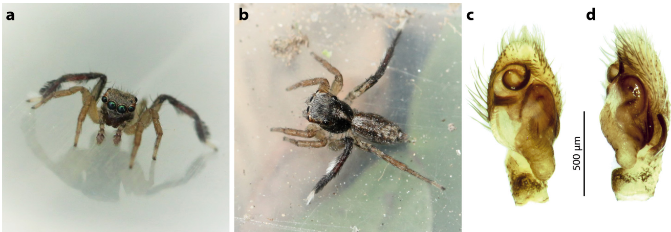
Fig. 1: Habitus. a. frontal; b. dorsal and left pedipalp; c. ventral; d. retrolateral of a male Saitis tauricus Kulczyński, 1905 from Bozen/Bolzano, Italy (the right leg IV is missing)

in April 2017 at the train station of Untermais/Maia Bassa, a district of the city of Meran/Merano. This specimen was found near benches on the rail tracks.