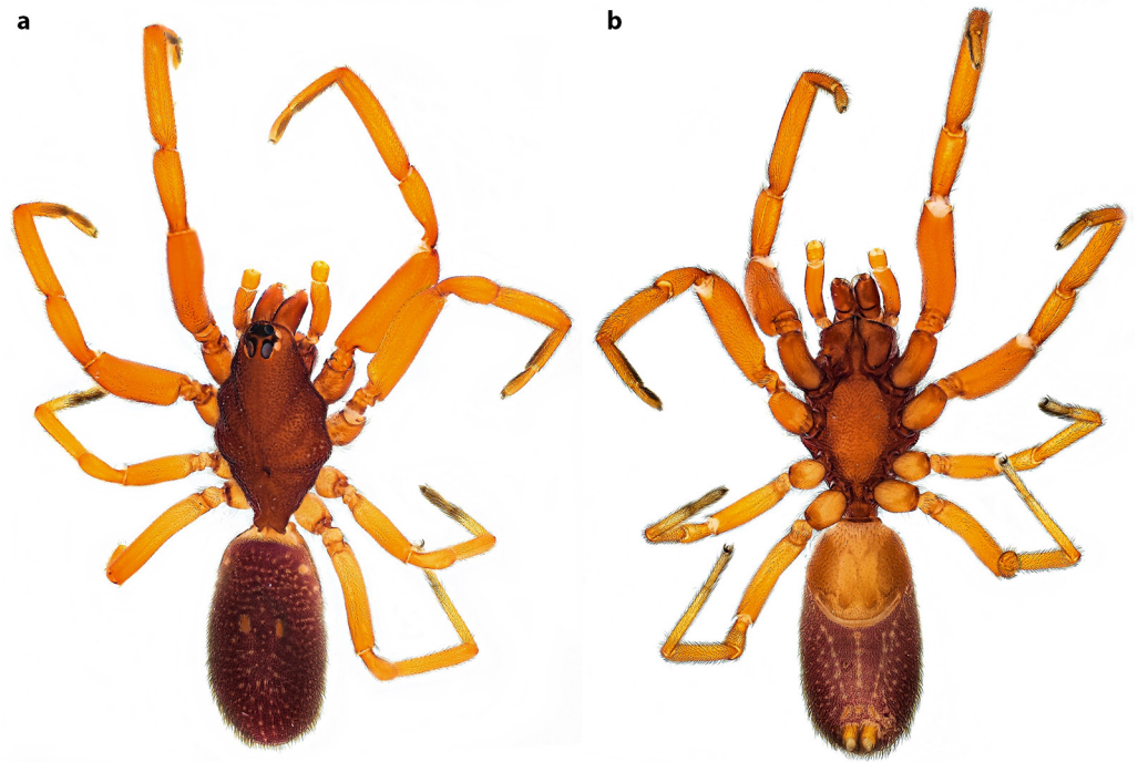
Fig. 1: Stenochilus hobsoni , male habitus, a. dorsal view, b. ventral view

mily) extends the range of the species 3000 km to the west (Fig. 3).