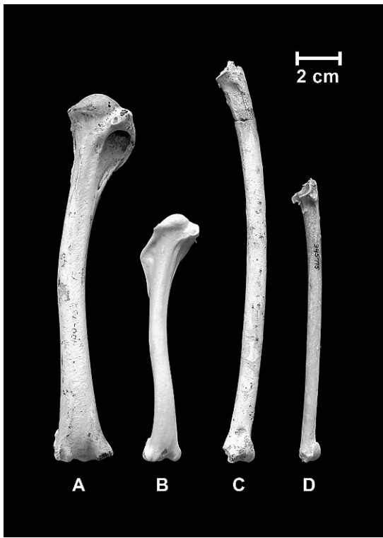
Figure 2. Wing elements of Buteogallus borasi (A, C) compared with B. urubitinga (USNM 345775; B, D). A, left humerus in anconal view (CZACC 400-732); C, right ulna in palmar view (CZACC 400-671).

right ulna without olecranon (CZACC 400-671); distal half of right ulna (WS 920E); proximal and distal ends of a left carpometacarpus (WS 78); right carpometacarpus without metacarpal III and distal metacarpal symphysis (CZACC 400-687); left femur (WS 919E); right femur without head and external condyle (WS 919B); right femur without distal end (CZACC 400-672); proximal end of right femur (OA X-2972); distal end of right femur (OA 2967); proximal end of left fibula (CZACC 400-688); fragmentary left tibiotarsus without distal end (CZACC 400-670); distal ends of left tibiotarsi without external condyles (CZACC 400-683, WS 64); right tibiotarsus without proximal end (CZACC 400-650); shaft of right tibiotarsus (CZACC 400-656); proximal segment of shaft of right tibiotarsi (WS 1001,1002); proximal half of left tarsometatarsus lacking inner calcaneal ridge (WS 933); fragmentary distal ends of left tarsometatarsi (OA 3206, WS105); right tarsometatarsus (CZACC 400-659); proximal