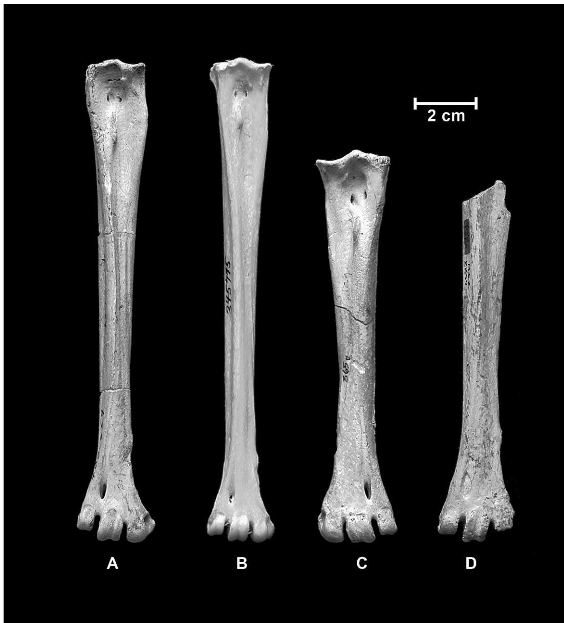
Figure 1. Tarsometatarsi in anterior view of large fossil West Indian Accipitridae compared with that (B) of the Great Black-Hawk Buteogallus urubitinga (USNM 345775). A, Buteogallus borasi (CZACC 400-659); C, Amplibuteo woodwardi (WS 365); D, Titanohierax gloveralleni , holotype (MCZ 2257). The bone of B. urubitinga has been photographically enlarged to the same size as that of B. borasi and the scale bar does not apply to image B.

Status and distribution. Extinct species, known only from Cuba.