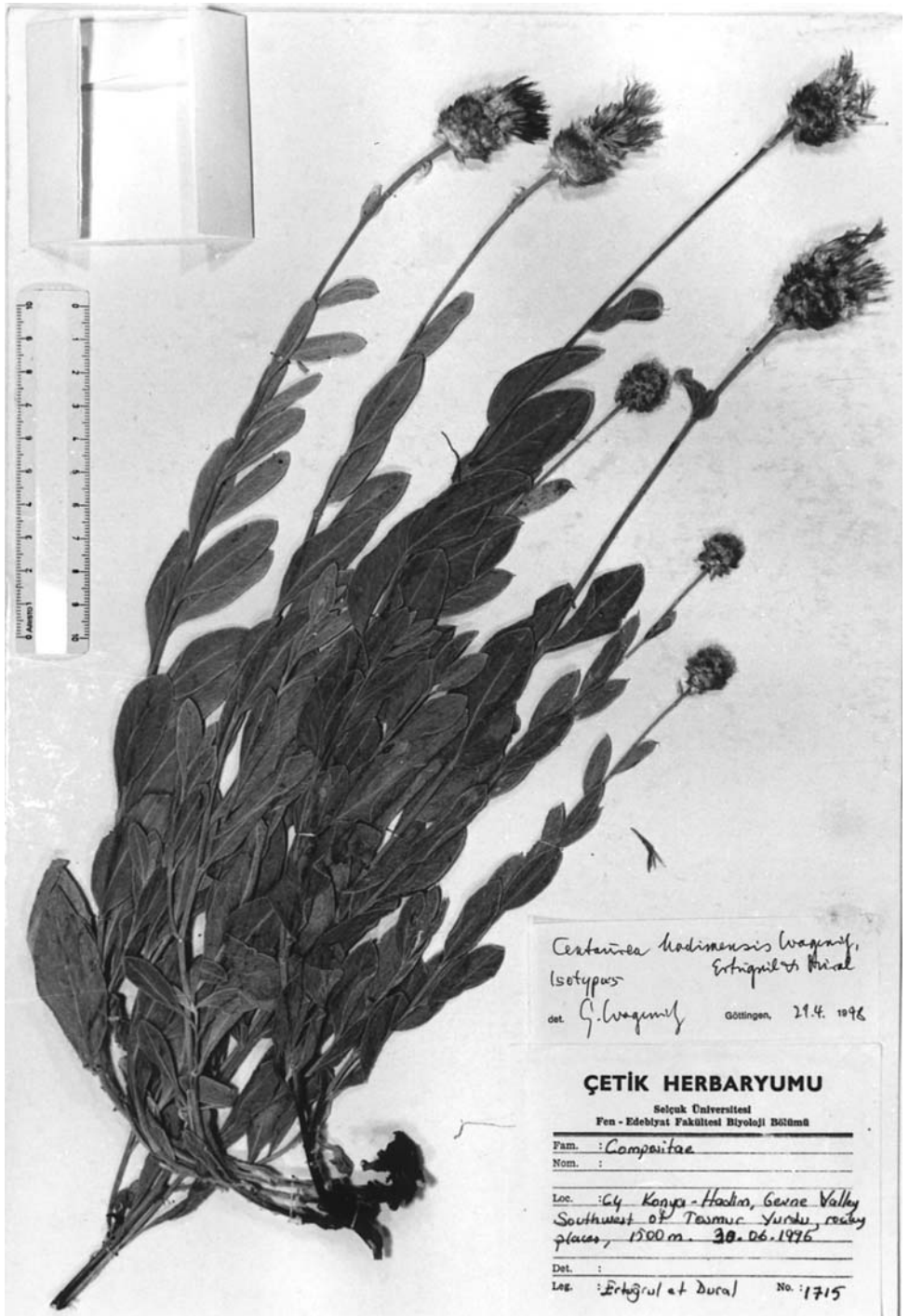
Fig. 1. Centaurea hadimensis (isotype at GOET).