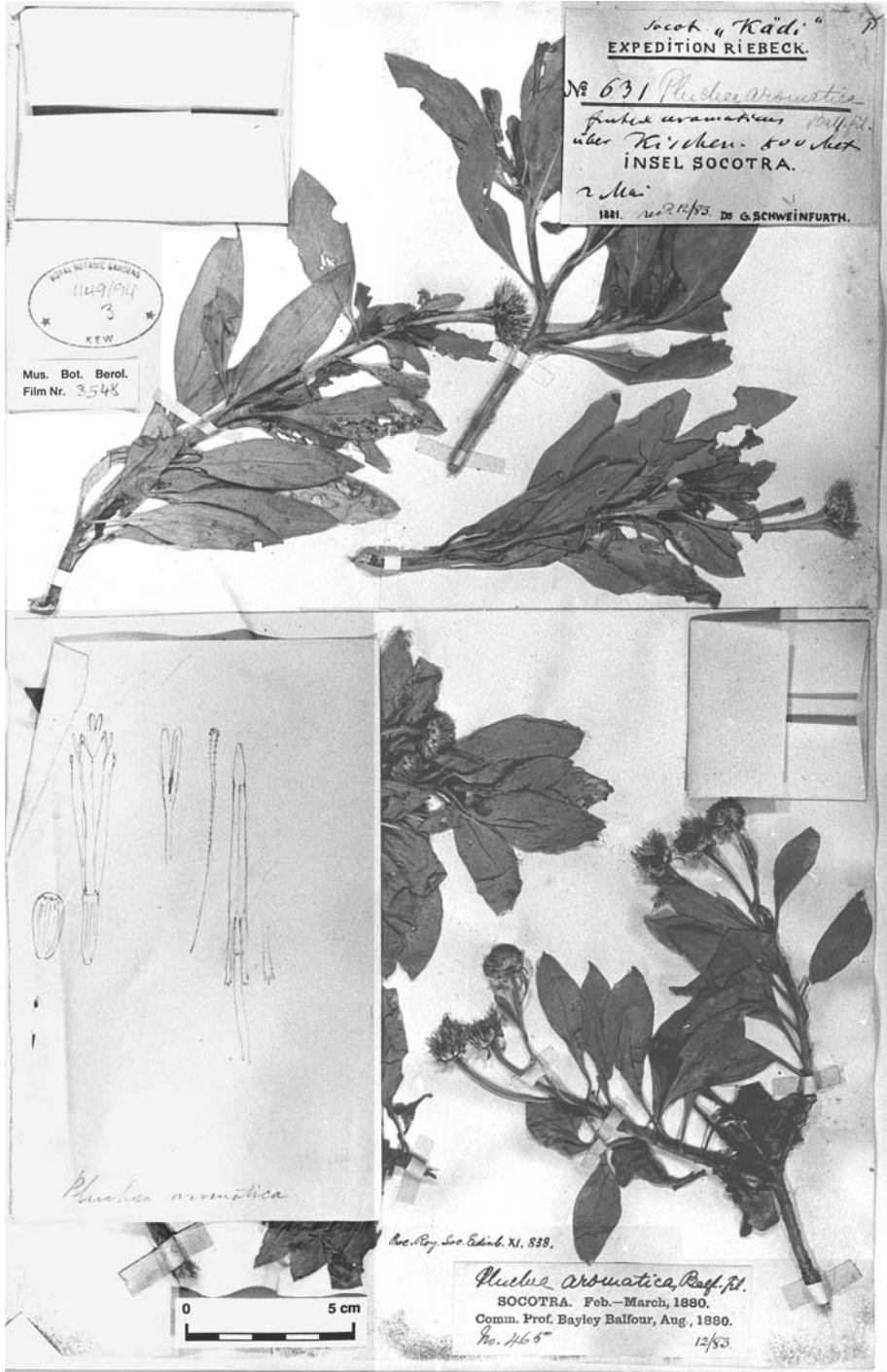
Fig. 1. Pulicaria aromatica – type sheet at Kew, with the lectotype Balfour 465 and the paralectotype Schweinfurth 631.