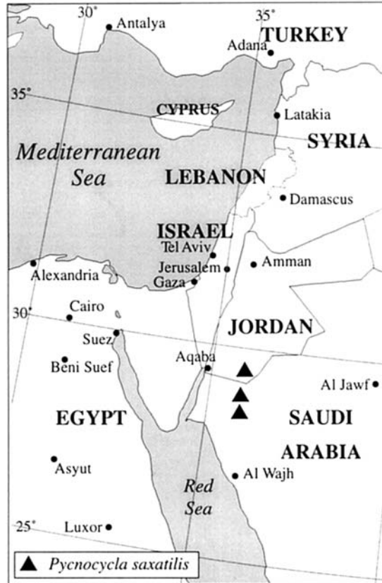
Fig. 2. Distribution of Pyncocycla saxatilis Danin, Hedge & Lamond.

mentose. Sepals 0.5 mm long, acicular, \pm conspicuous; in fruit 1-1.8 mm long. Petals white or white-rose, marginal not or slightly radiant. Mericarps oblong-cylindrical, curved, densely tomentose, only one mericarp develops (Fig. 1i); styles c. 5 mm. Fl. 6(?)–11.