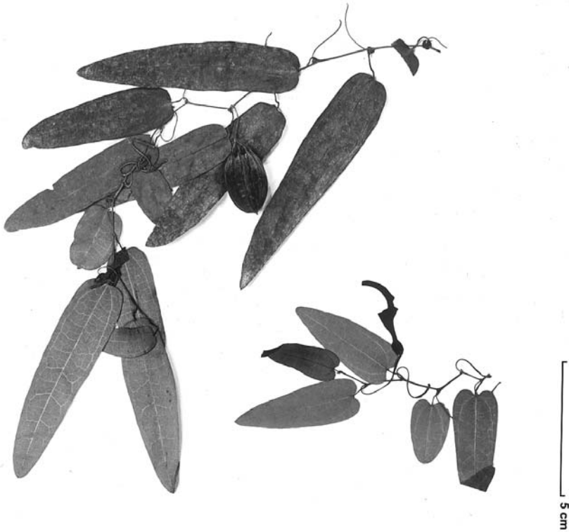
Fig. 4. Aristolochia stenophylla – one flowering and one fruiting branch from the epitype collection (Greuter & Rankin 24893).

nio del Sur, Abra de Mariana, loma al este del barranco, 6.2.1978, Bisse & al. 36553 (HAJB, JE); San Antonio del Sur, Abra de Mariana, loma al oeste del barranco, 6.2.1978, Bisse & al. 36594 (B, HAJB, JE, K).