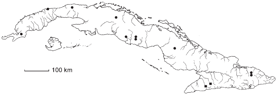
Fig. 3. Map showing the total known distribution of Wallenia bumelioides (dots) and W. maestrensis (squares).

Distribution: Endemic to the Sierra Maestra, E Cuba (Fig. 3). Growing in cloud forest (monte nublado) on yellowish-red mountain soil, at altitudes of 900-1974 m a.s.l.