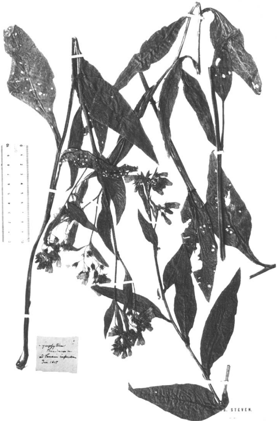
Fig. 4. Symphytum tanaicense – type specimen at the Botanical Museum, University of Helsinki (H).