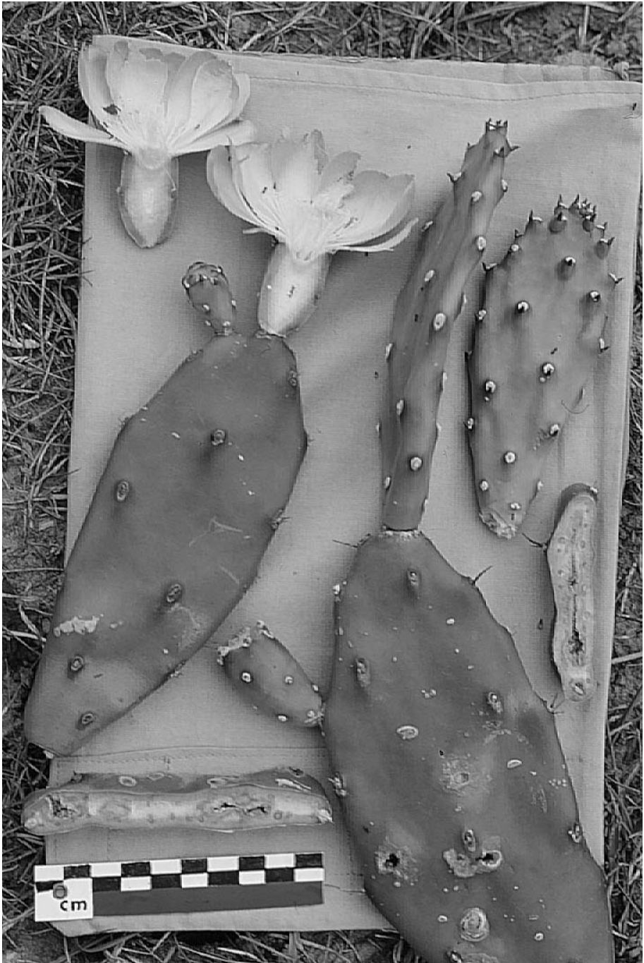
Fig. 2. Opuntia cardiosperma K. Schum. from Corrientes (Argentina), leg. Leuenberger & Arroyo-Leuenberger 4749 , material for the herbarium prior to drying.