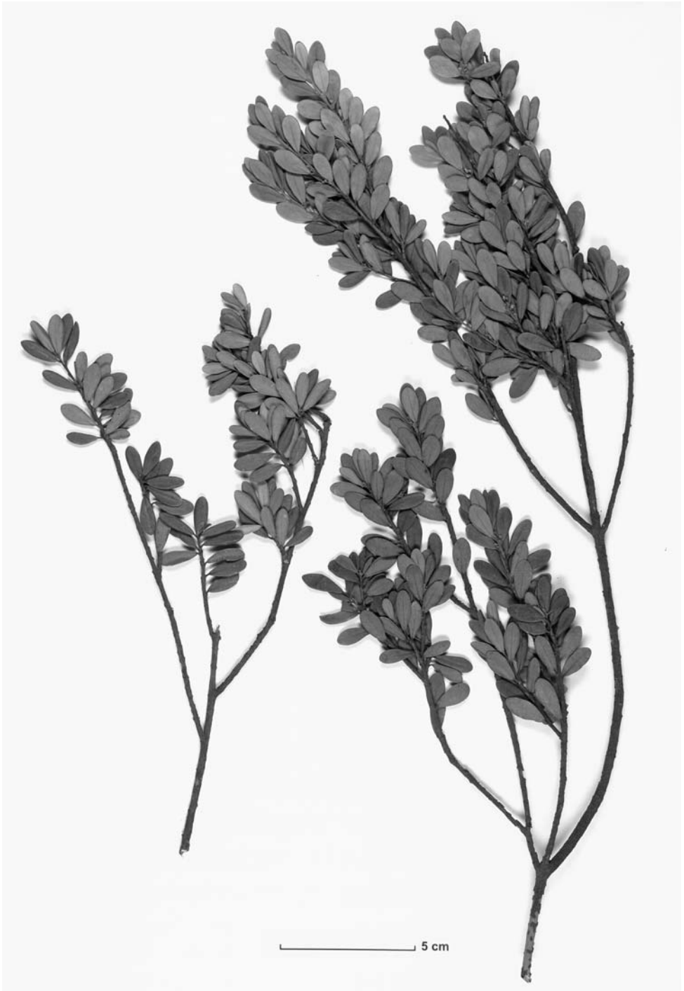
Fig. 2. Isotype specimen of Polygala guantanamana subsp. alternifolia (PFC 42965, B).