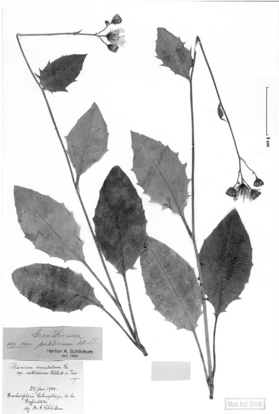
Fig. 4. Type of Hieracium maculatum subsp. subdivisum A. Schlickum & Touton with a label handwritten by Schlickum. The “T” on the right side of the label means that the specimen has been revised by K. Touton. The handwritten determination on the additional label is by K. Touton.