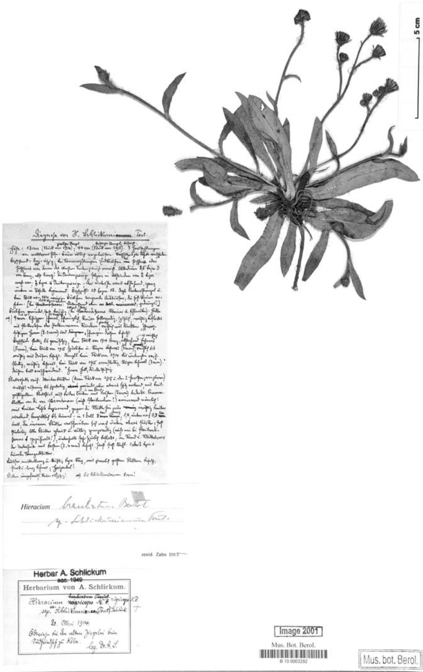
Fig. 1. Type of Hieracium pseudonigriceps subsp. schlickianum Touton with label and diagnosis written by Schlickum. The "T" on the right side of the label indicates that the specimen has been revised by K. Touton. The handwritten determination on the additional label is by K. H. Zahn.