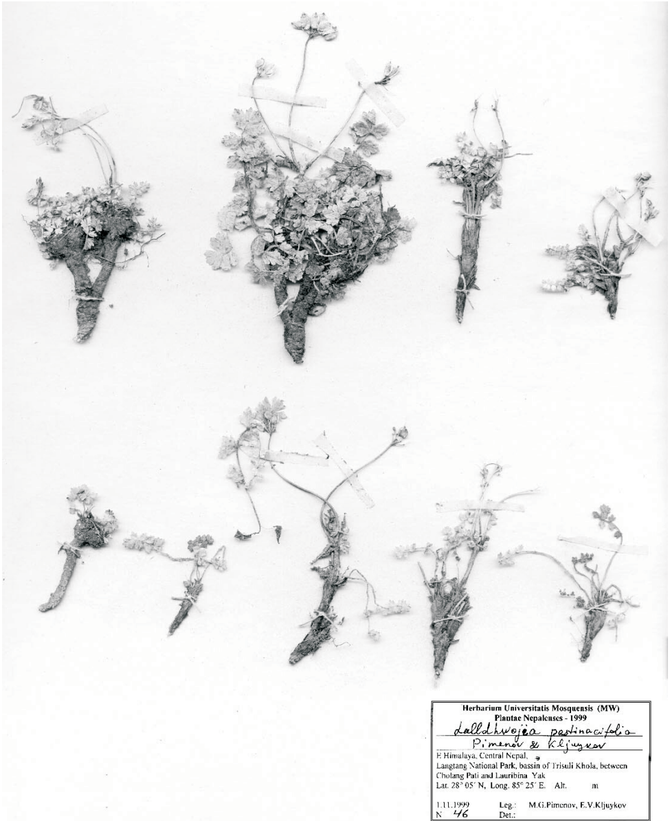
Fig. 1. Lalldhwojia pastinacifolia Pimenov & Kljuykov (holotype specimen at MW).

Plantae perennes , polycarpicae, caudicibus pauciramosis vel integris, vix incrassatis, a collo residuis fibrosis petiolorum foliorum tectis, radicibus principalibus verticalibus, lateralibus funiformibus. Caules solitarii , eramosi, aphylli, fructificatione paene glabri, tenues, sulcati. Folia radicalia plus minusve numerosi, rosulantia, petiolis 1-3 cm longis, laminis pinnatis, 4-6-jugatis, 3-5 × 1-2 cm, ambitu lanceolatis vel lanceolato-linearibus, segmentis sessilibus, late