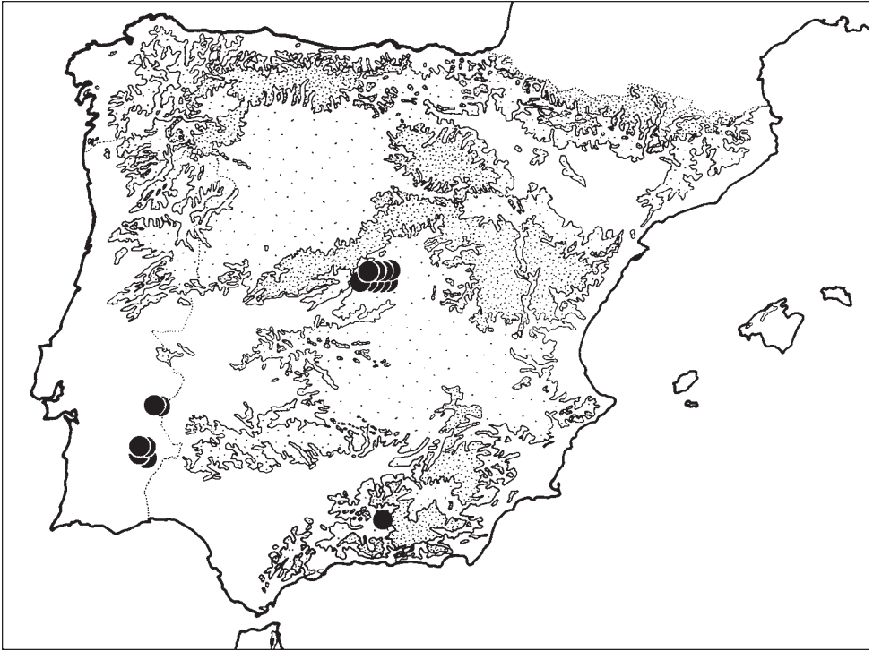
Fig. 3. Known European distribution of Arcyna tournefortii , based on available specimens.

them only in Arctium L., Cynara spp. and Ptilostemon stellatus (L.) Greuter (Greuter, l.c.: 29-30). They appear to be reduced forms of the whip-like hairs that are common throughout the Asteraceae (Solereider, Syst. Anat. Dicotyledons 1. 1908).