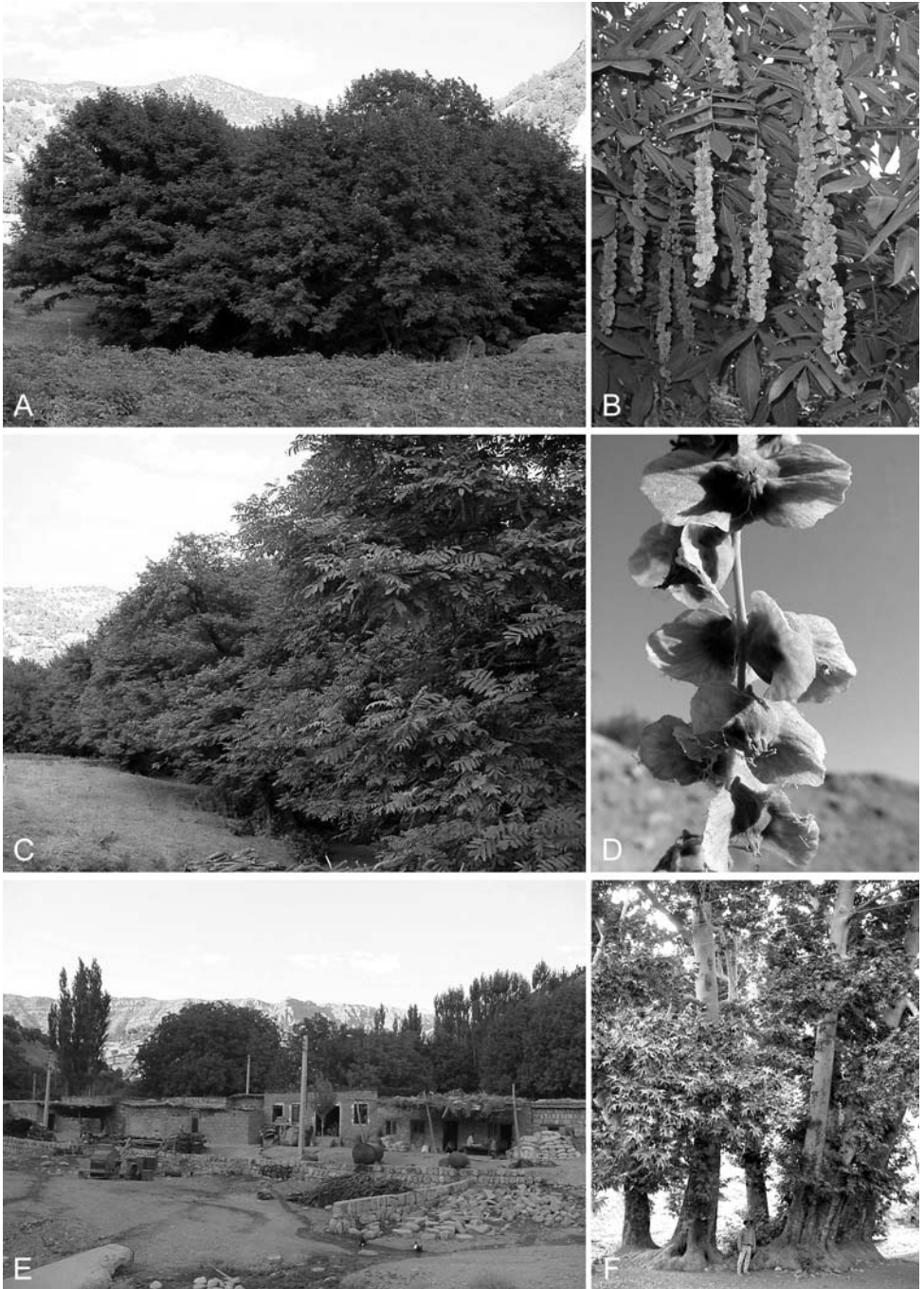
Fig. 3. Pterocarya fraxinifolia in the village of Derakhtchaman – A, C: dense population along the river with the Quercus brantii forest of the surrounding mountains in the background; B, D: fruiting spikes; E: view of the village; F: old Platanus orientalis tree with seven trunks just near P. fraxinifolia .