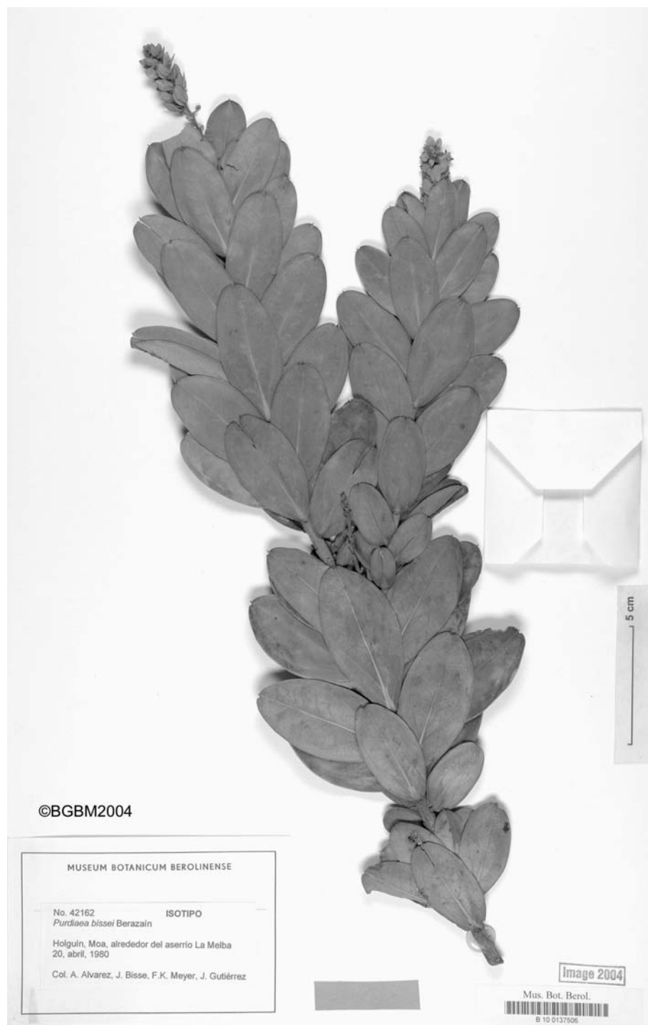
Fig. 1. Isotype specimen of Purdiaea bissei , HFC 42162 (B).