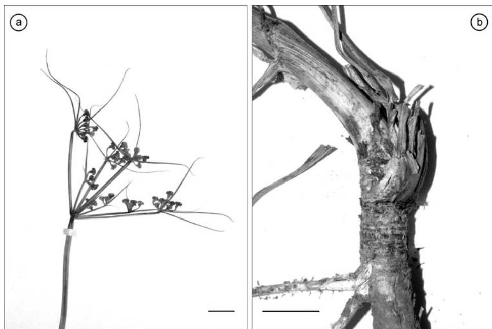
Fig. 3. Peucedanum longibracteolatum , photographs of herbarium material ( Ulrich 3/30 [holotype]) – a: compound umbel, flowering (note the extremely unequal rays and long extended bracteoles; b: rootstock with petiolar remains. – Scale bars: 0.5 cm (a), 1 cm (b).

1220 m, Steilhang, Exp. E, 25.10.2001, Ulrich 1/142 (MSB [fruiting synflorescences]). – C4 İÇEL: Silifke-Kırobası, etwa 22 km N Silifke, 980 m, eingezäuntes, bebuschtes Gelände, 21.10.2002, Ulrich 2/61 (herb. Parolly [fruiting synflorescences]).