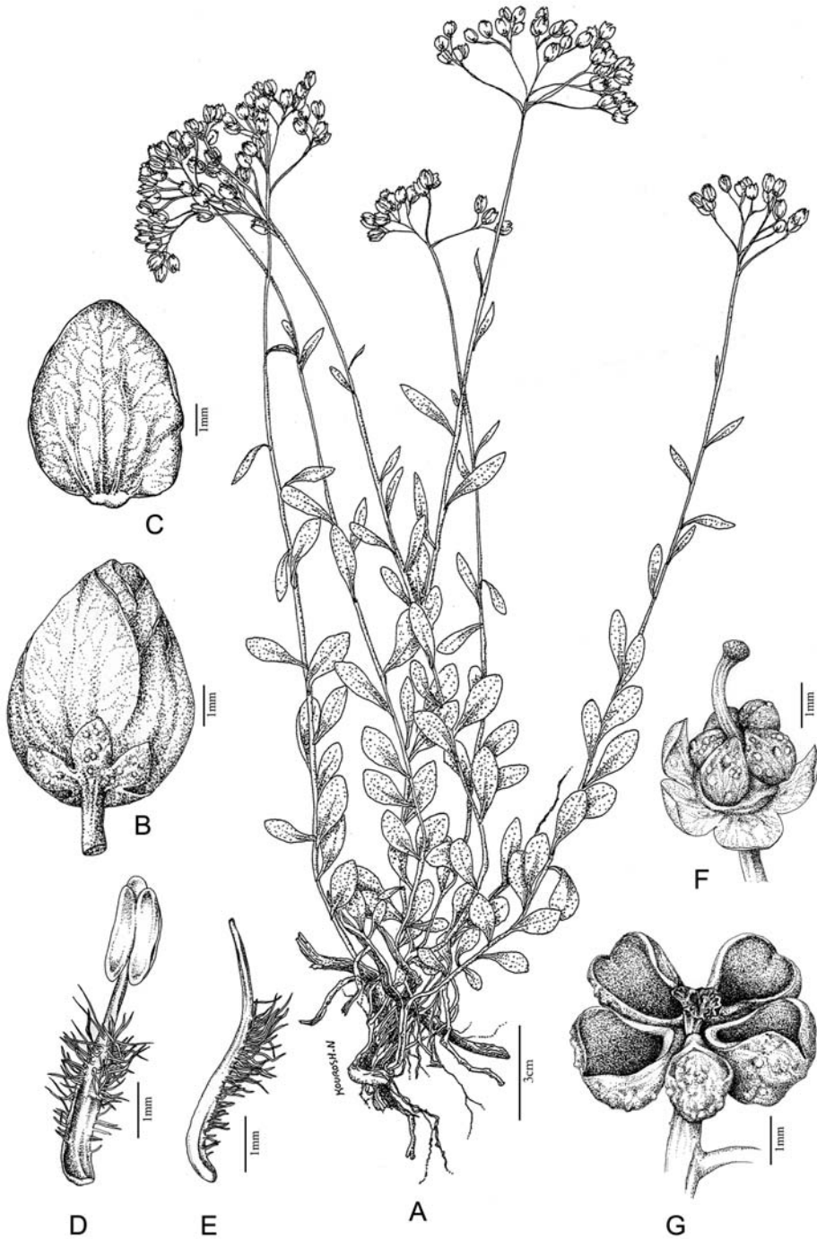
Fig. 1. Haplophyllum bakhteganicum – A: habit; B: flower; C: petal; D: stamen; E: filament, side view; F: gynoecium with lateral rather than apical tubercles of the ovary segments; G: dehiscent capsule. – Drawings by Kourosh Nozadian after the holotype.