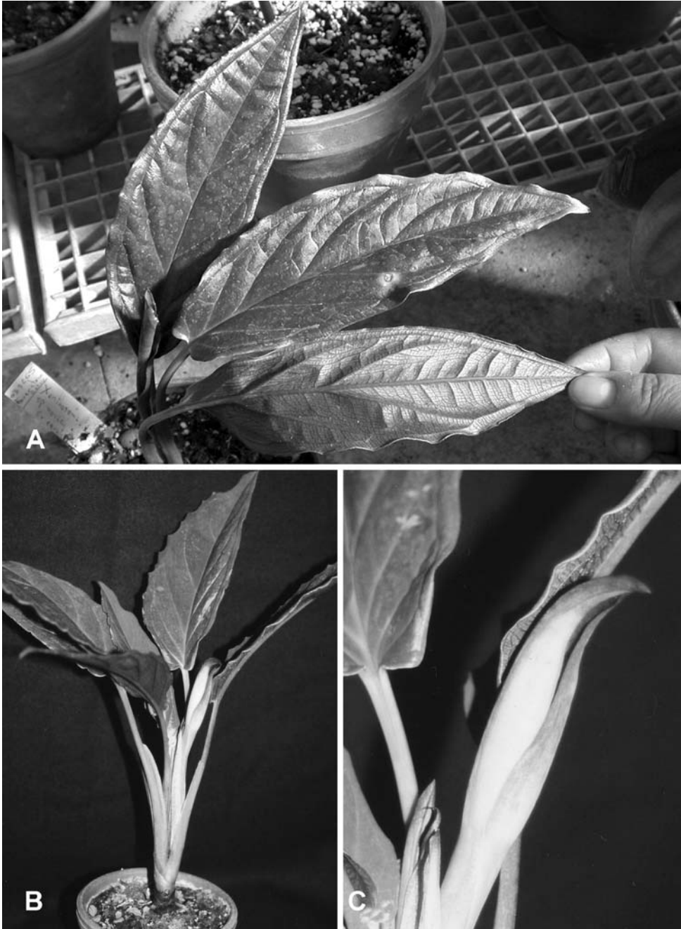
Fig. 1. Xanthosoma feuersteiniae – A: leaves, lower face purplish; B: habit with inflorescence; C: close-up of inflorescence. – from a plant [no. 2003. 3.265], of the type collection (A) and of cuttings of that (B, C), all cultivated at the Conservatoire and Jardins Botaniques de Nancy.