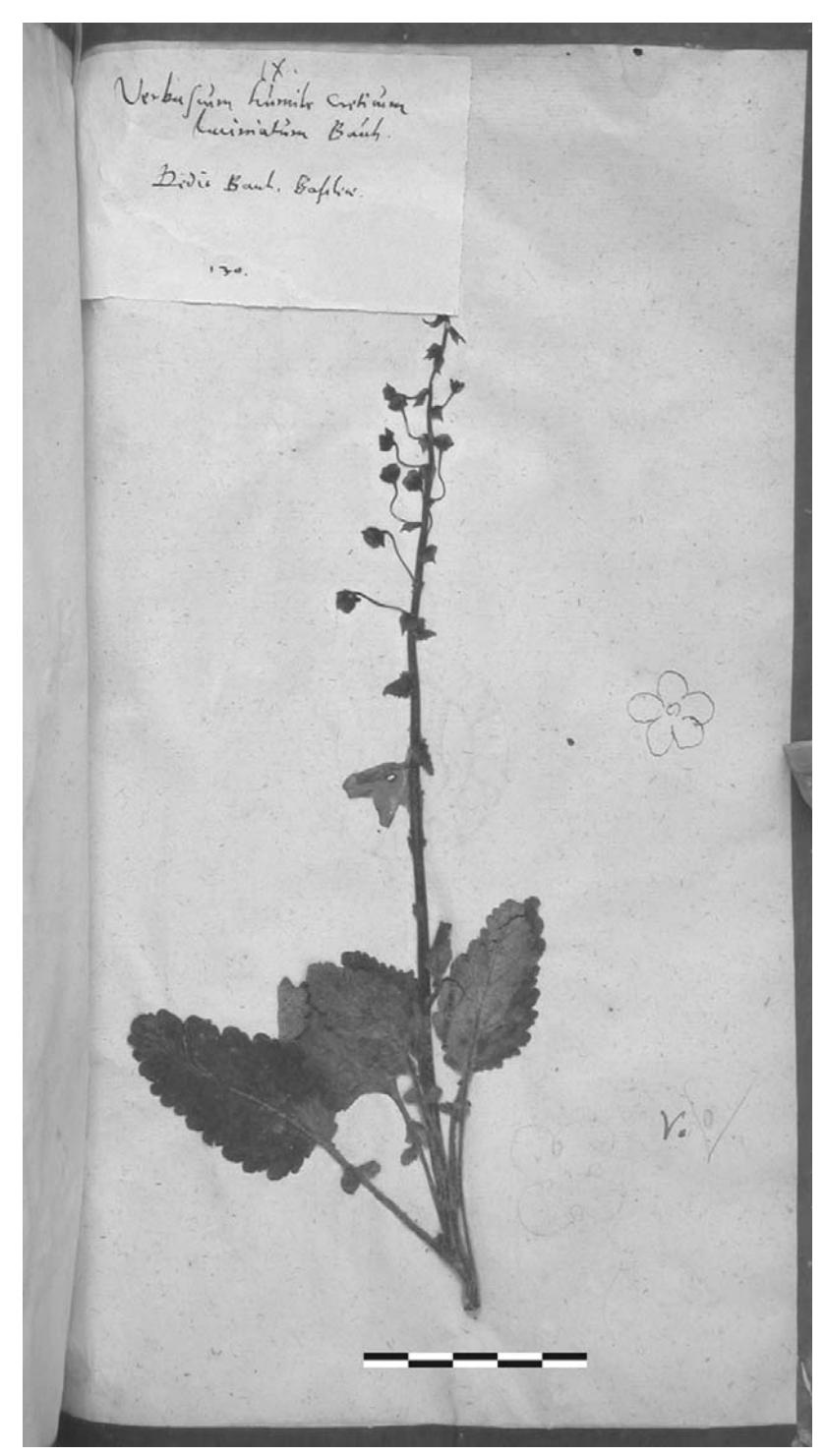
Fig. 3. Lectotype of Verbascum arcturus L. – Herb. Burser XIII: 130 (UPS). – Scale bar: 5 cm.