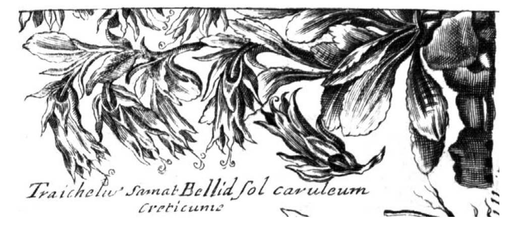
Fig. 1. Lectotype of Campanula saxatilis L. – Boccone, Mus. Piante: ad t. 64. 1697.