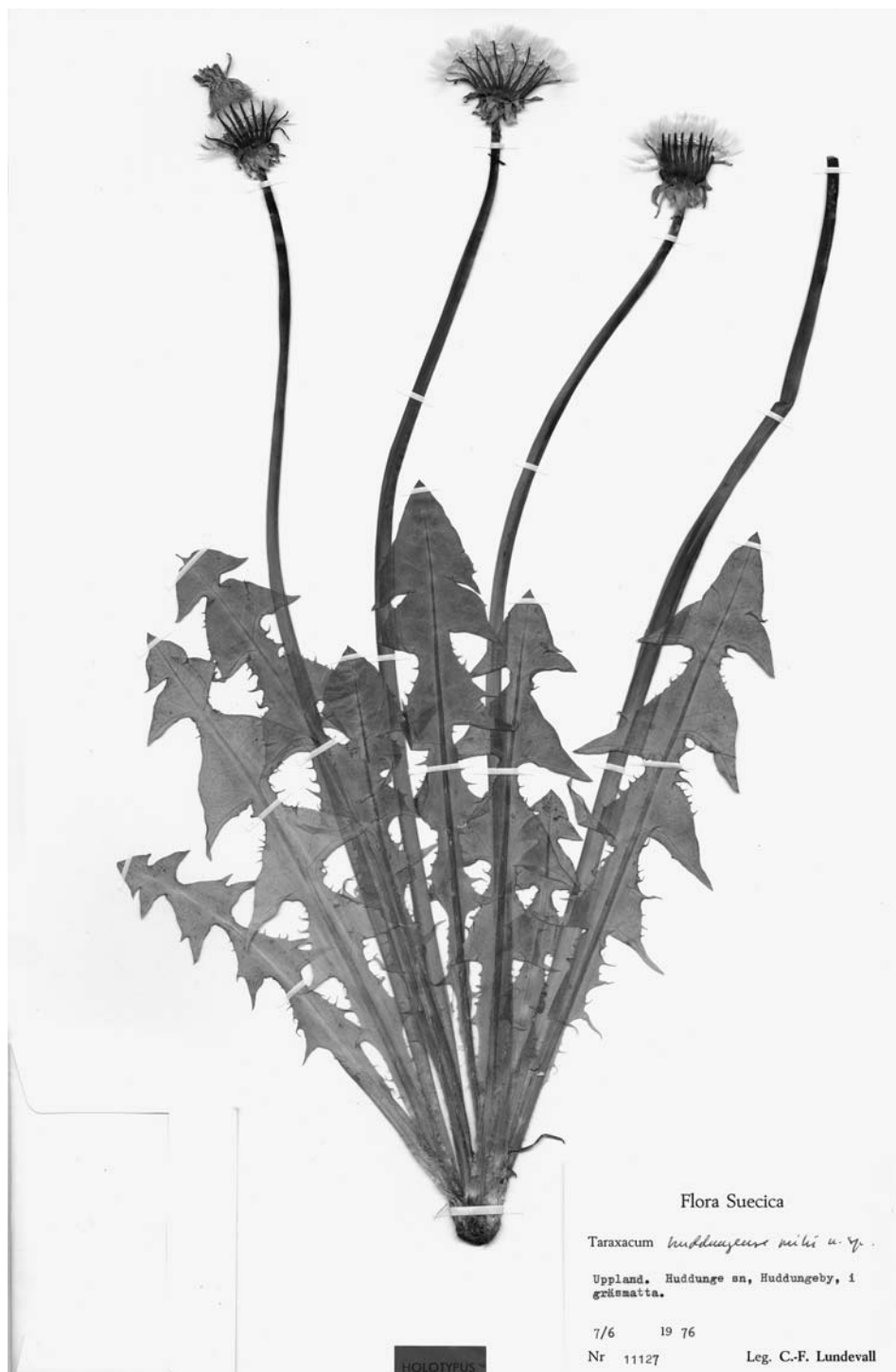
Fig. 4. Taraxacum huddungense , holotype (S).