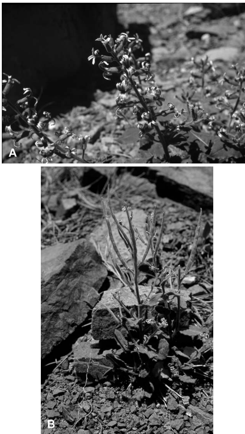
Fig. 2. Hesperis kuerschneri at its type locality SW Turkey, Denizli, Tuzla Beli, 1300 m – A: flowering, 7.5.2002 ; B: fruiting, 25.5.2005. Downloaded From: https://bioone.org/journals/Willdenowia on 12 Dec 2024 Terms of Use: https://bioone.org/terms-of-use