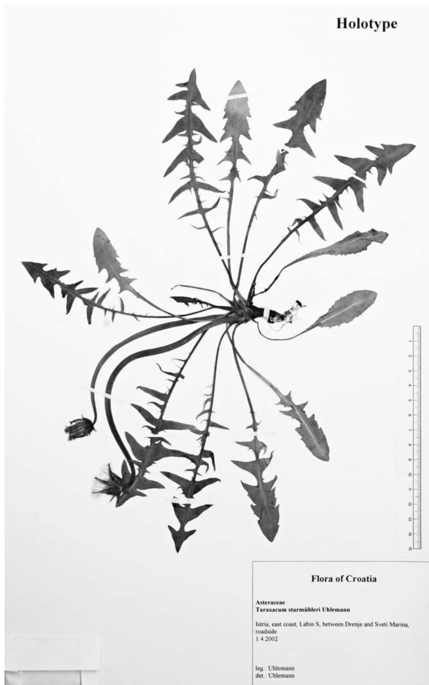
Fig. 1. Taraxacum starmuehleri , holotype specimen at B.