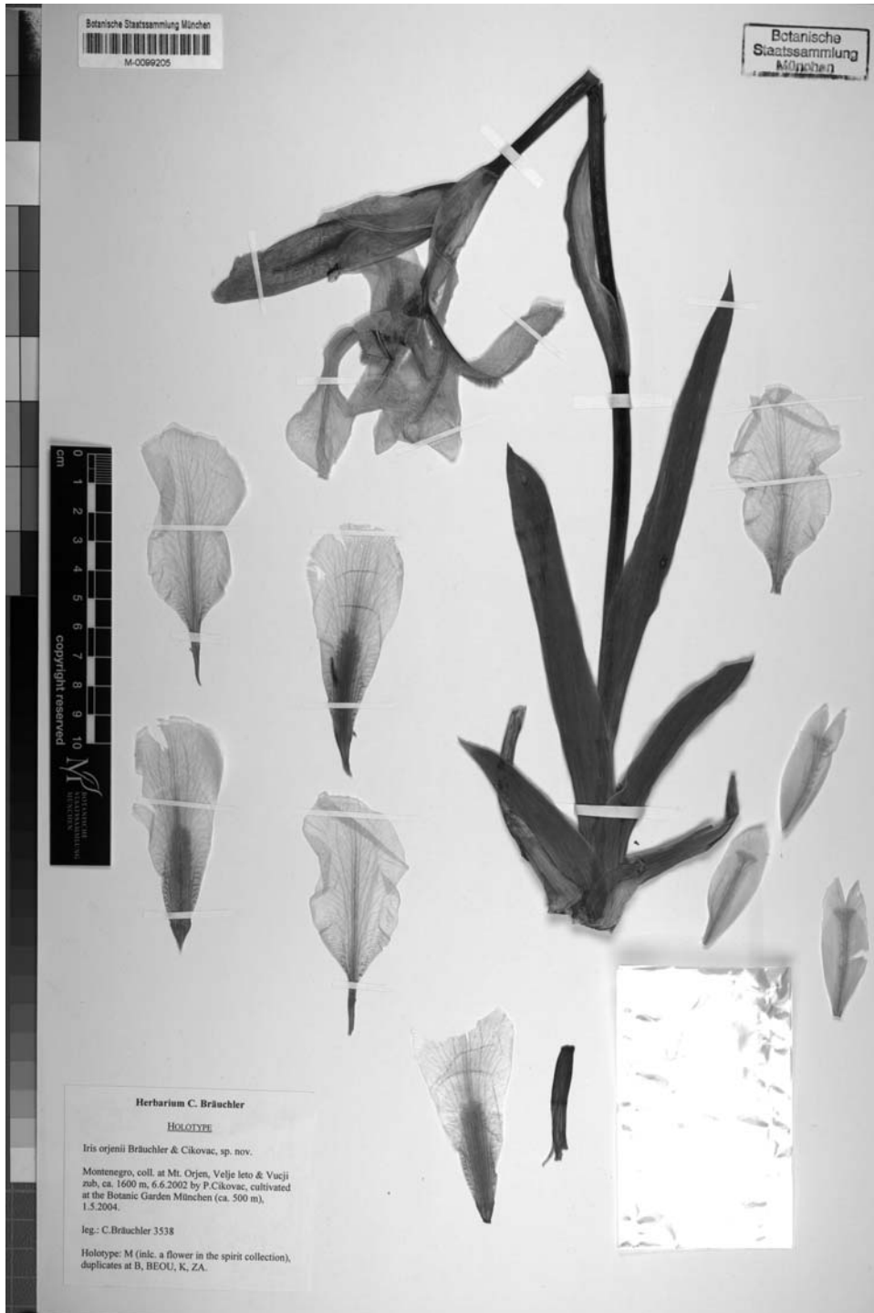
Fig. 1. Iris orjenii – holotype at M.