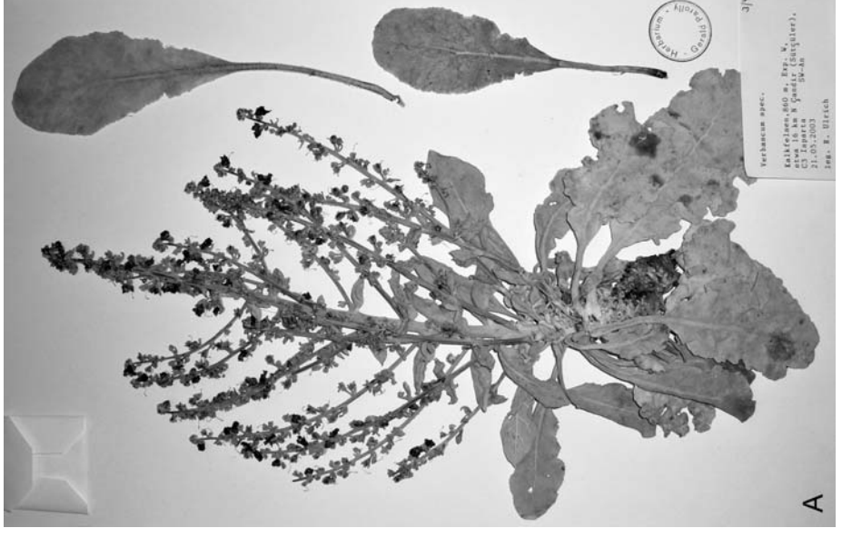
Fig. 1. Verbascum lindae – A: habit, holotype (herb. Parolly); B: leaves (Ulrich 4/9b herb. Parolly).