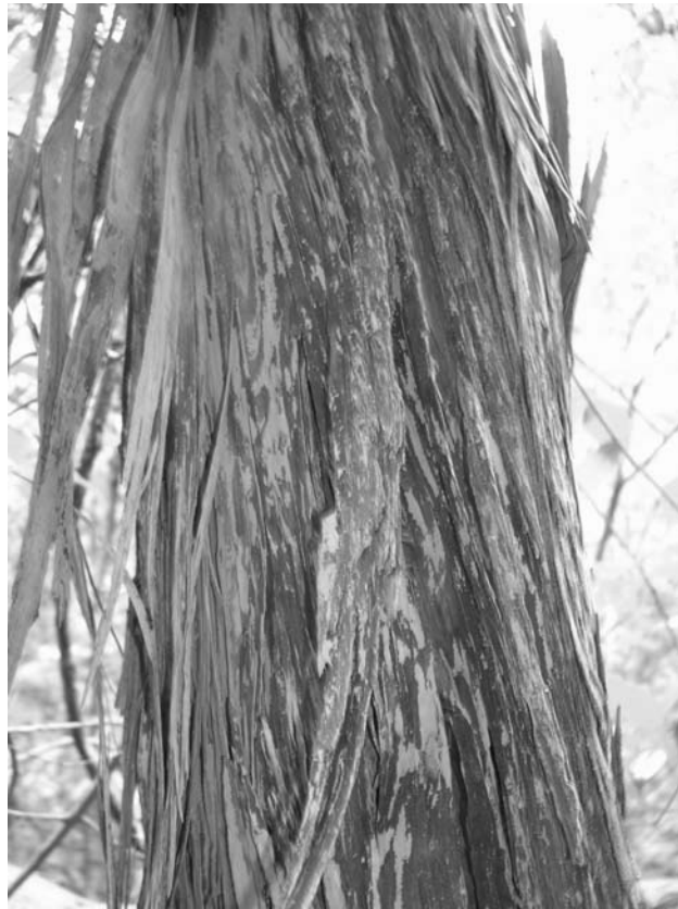
Fig. 2. Trunk of Tetrazygia decorticans , with bark peeling off in laminar shreds.

species is very rare. It occurs from 600-650 m in seasonally wet evergreen forest. Associated melastome species include: Miconia prasina (Sw.) DC., Meriania leucantha subsp. nana (Triana) Borhidi, Tetrazygia bicolor (Mill.) Cogn. and Clidemia barbeyana Cogn. Other associated species include Calyptronoma plumeriana (Mart.) Lourteig, Cyathea arborea (L.) Sm., Alsophila cubensis (Underw. ex Maxon) Caluff & Shelton, Cinnamomum montanum (Sw.) J. Presl, Ocotea leucoxyton (Sw.) Mez, Guarea guidonea (L.) Sleumer, Talipariti elatum (Sw.) Frixell, Roystonea regia (Kunth) O. F. Cook, Dendropanax arboreus (L.) Decne. & Planch., Faramea occidentalis (L.) A. Rich., Wallenia laurifolia (Jacq.) Sw., Citharexylon caudatum L., Casearia sylvestris Sw. subsp. sylvestris and Tabernaemontana ambliocarpa Urb.