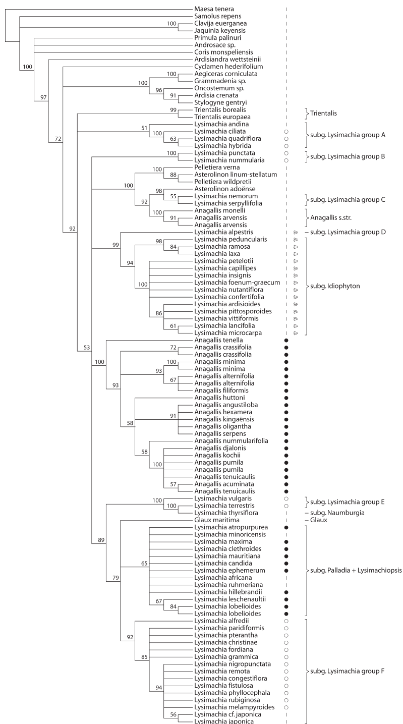
Fig. 1. Jackknife tree obtained from the Xac analysis of ndhF . Jackknife support values (> 50 %) are indicated above the nodes. – ○ = Flowers with oil-producing trichomes; ● = flowers with nectar-producing tri-