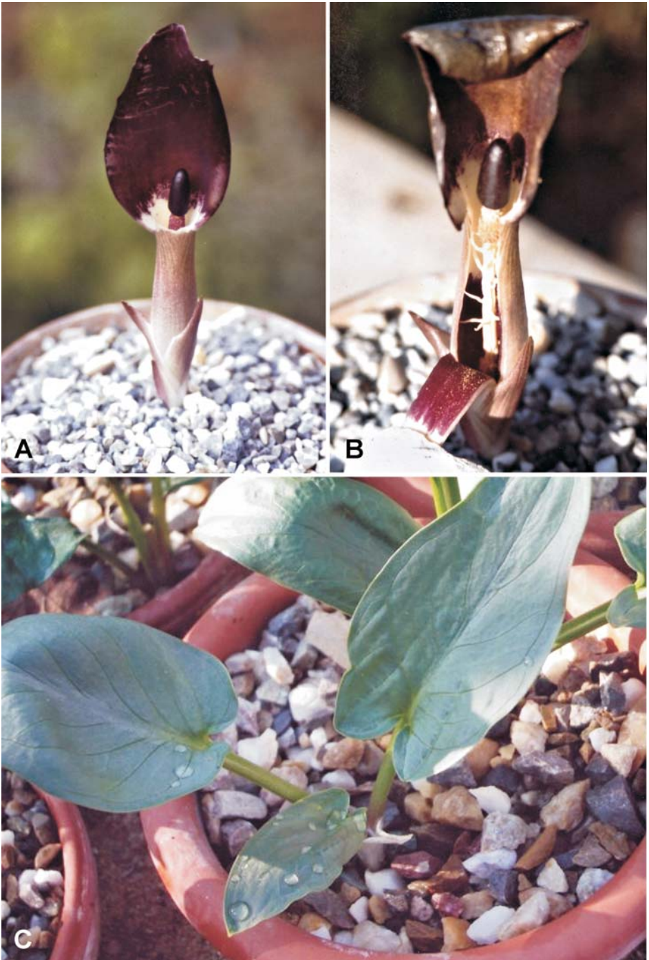
Fig. 2. Eminium jaegeri – A: flowering in cultivation, note the apex of the spathe still being erect; B: inflorescence, tube of spathe opened to show the sterile flowers between the female and male flowers; C: cultivated plant with leaves.