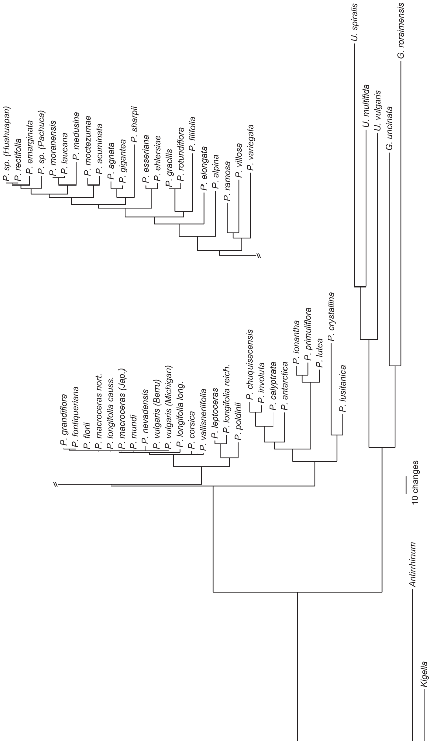
Fig. 3. Bayesian phylogram based on the matK/trnK dataset. Note the longer branch of Pinguicula chuquisacensis relative to its sister group P. involuta , caused by autapomorphies. The branches of the species of Genlisea and Utricularia are distinctly longer, caused by their distinctly higher mutation rates.