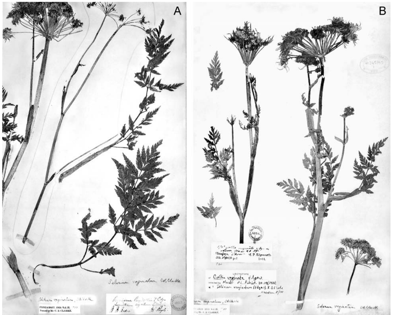
Fig. 1. Type specimens – A: Levisticum argutum Lindl. (K); B: Cortia vaginata Edgew. (K).

The name Selinum vaginatum , widely accepted at present, is based on Cortia vaginata Edgew. (Edgeworth 1845). However, Levisticum argutum Lindl. (Lindley 1835) refers to the same species, as a comparison of their type specimens, both kept in Kew (Fig. 1), revealed. Levisticum is a genus completely absent from the Himalayan flora. The description of L. argutum is rather short, and it is not surprising that the name was almost completely forgotten. Edgeworth (1845) and Clarke (1879) suggested (the latter with some hesitation) L. argutum was conspecific with Cortia elata Edgew. ( \equiv Ligusticum elatum (Edgew.) C. B. Clarke). Mukherjee & Constance (1993), however, did not confirm this synonymy.