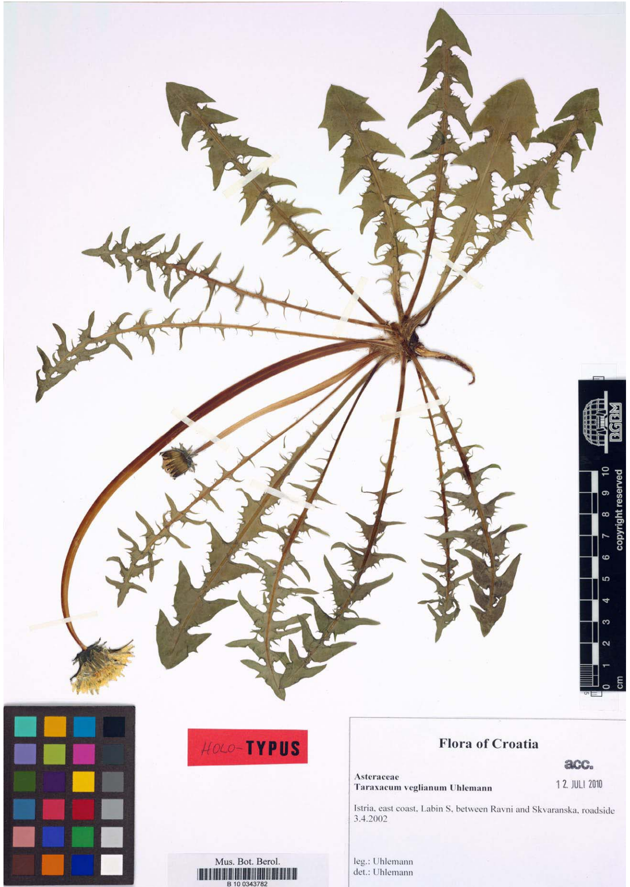
Fig. 1. Taraxacum veglianum , holotype specimen at B.