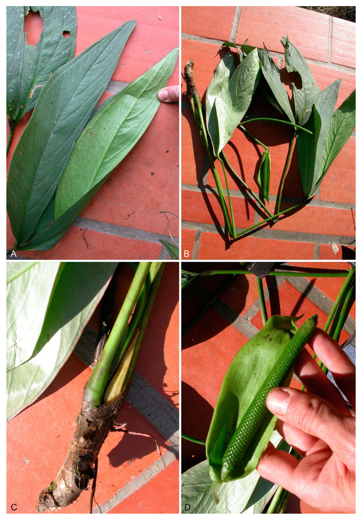
Fig. 6. Anthurium werneri – A: leaf blade, adaxial surface; B: flowering plant detached from tree; C: stem with base of petioles and cataphylls; D: inflorescence, close-up; photographs by F. Werner of living plants from the type collection.