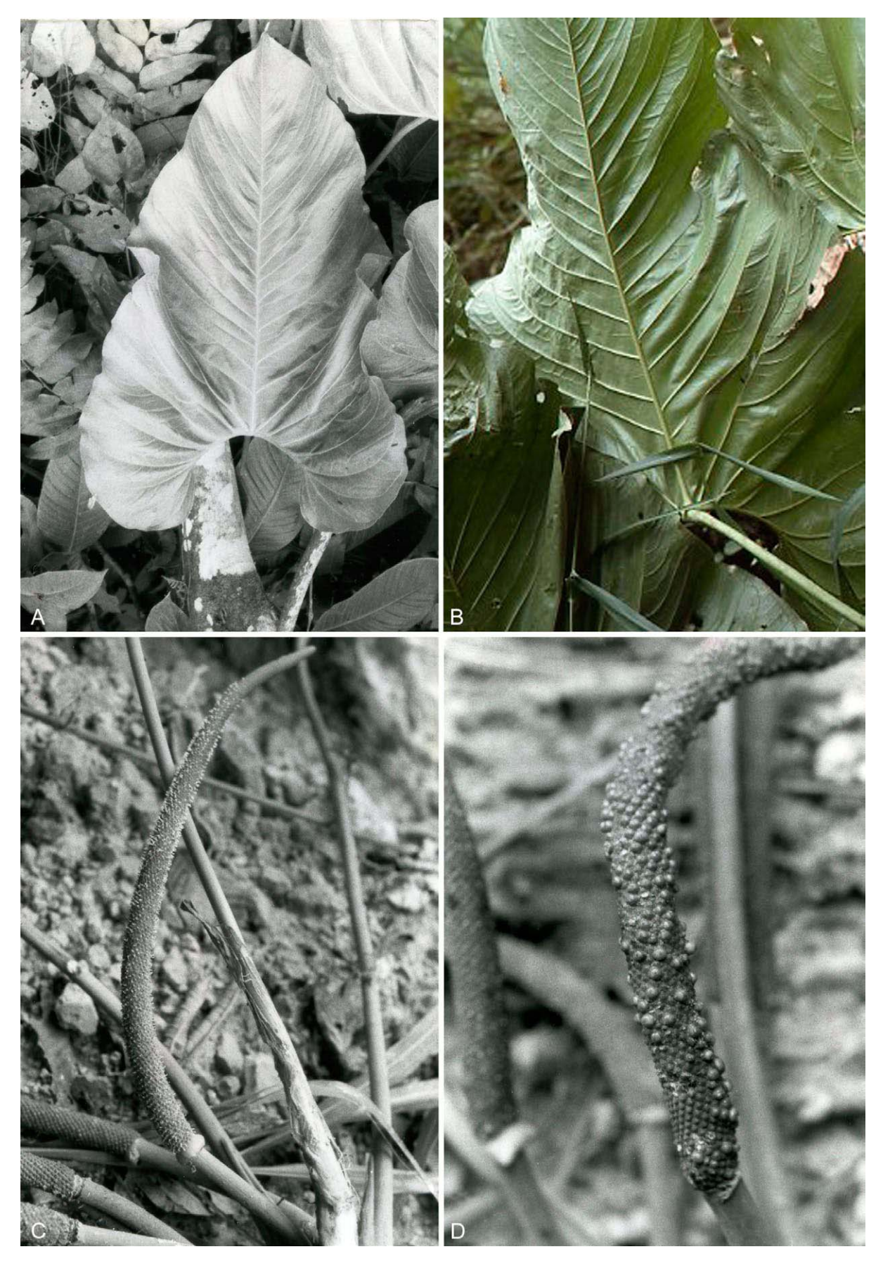
Fig. 5. Anthurium quinindense – A: leaf blade, adaxial surface; B: leaf blade, abaxial surface; C: inflorescence; D: infructescence, close-up. – Photographs by T. Croat of living plants from the type collection.