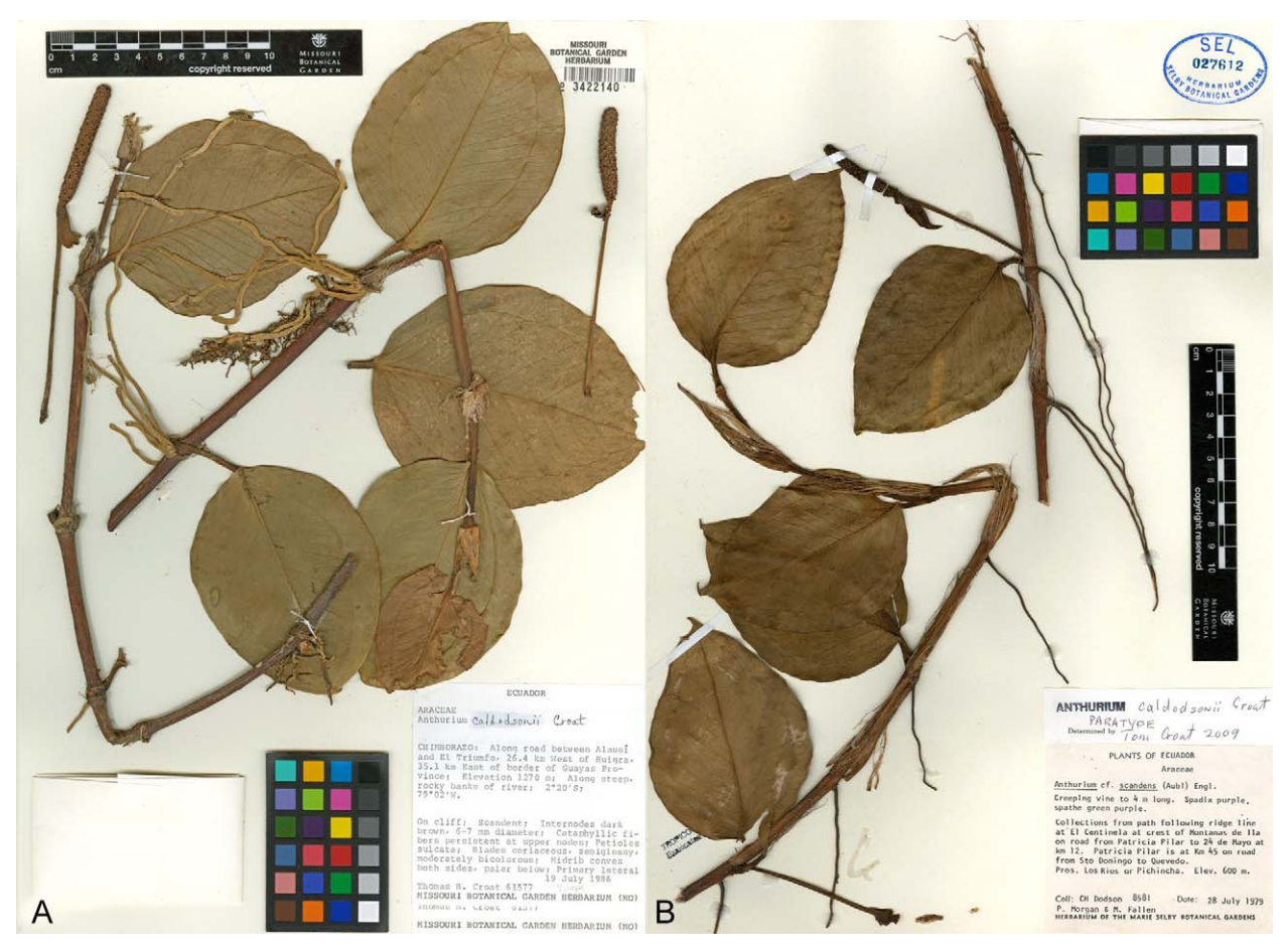
Fig. 1. Anthurium caldodsonii - A: holotype at MO, Croat 61577; B: paratype at SEL, Dodson 8581.

with the margins; upper surface drying greyish brown and matte, eglandular; lower surface slightly paler and dark yellowish brown, densely glandular-punctate, the glands moderately small (0.15 mm diam.). Inflorescence erect; peduncle 4.5-10 cm long (averaging 6 cm), 2-3 cm diam., about 3 \times as long as petiole, matte, medium brown; spathe reflexed, 2-2.4×0.4-0.6 cm (averaging 2.2×0.5 cm), elliptic, matte, green to greenish purple, drying deep brown; spadix 3.2-5.5 cm long, 4-7 mm diam., matte, violet-purple, drying deep brown; flowers 9–10 visible in the principle spiral, 5–7 visible in the alternate spiral, 2.2-2.4×2 mm; lateral tepals 1 mm wide, the outer margins 2-sided, the inner margin broadly rounded; stamens held at level of tepals, widely spaced on 4 sides of the pistil, 0.12 \times 0.2 mm, the thecae ovoid, slightly divaricate.