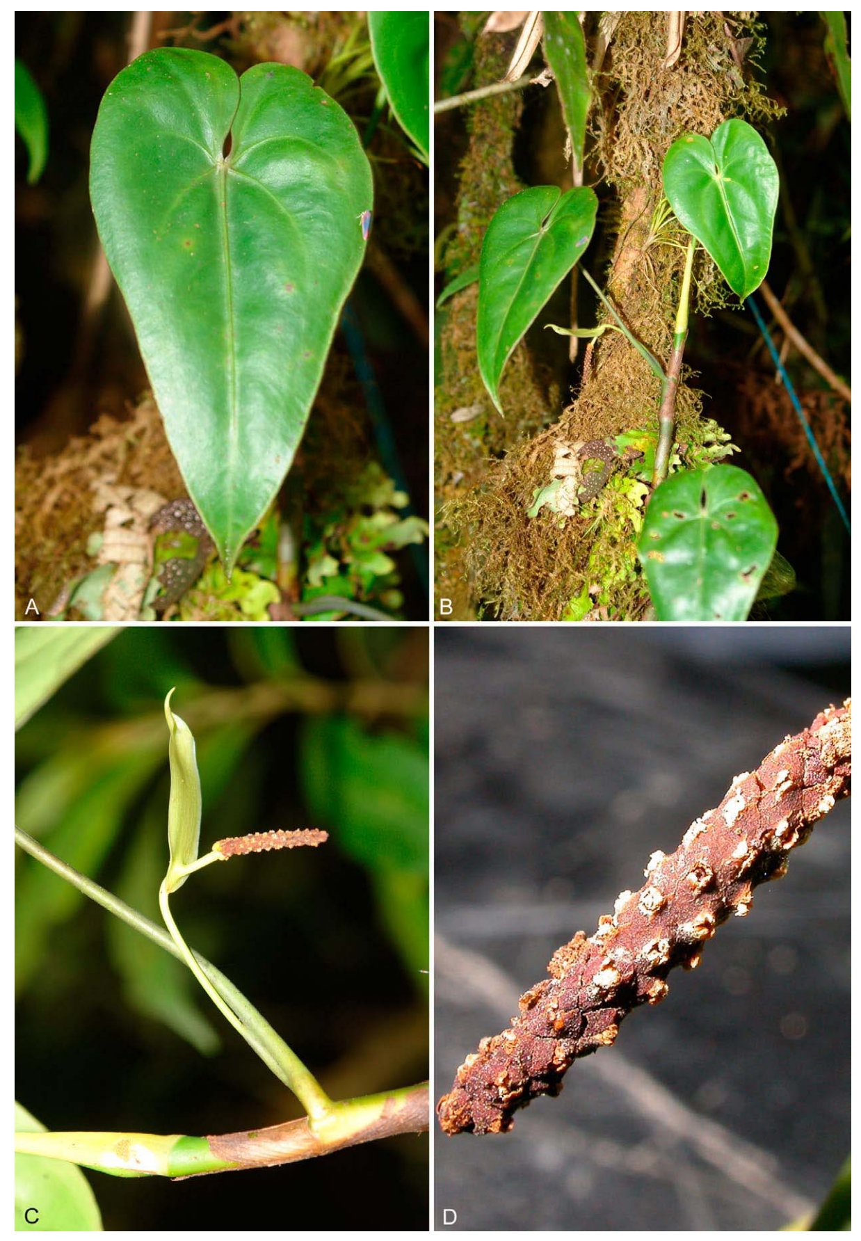
Fig. 4. Anthurium mendietae – A: leaf blade, adaxial surface; B–C: inflorescence, side view with stem; D: inflorescence, close-up. – Photographs by G. Mendieta of living plants from the type collection.