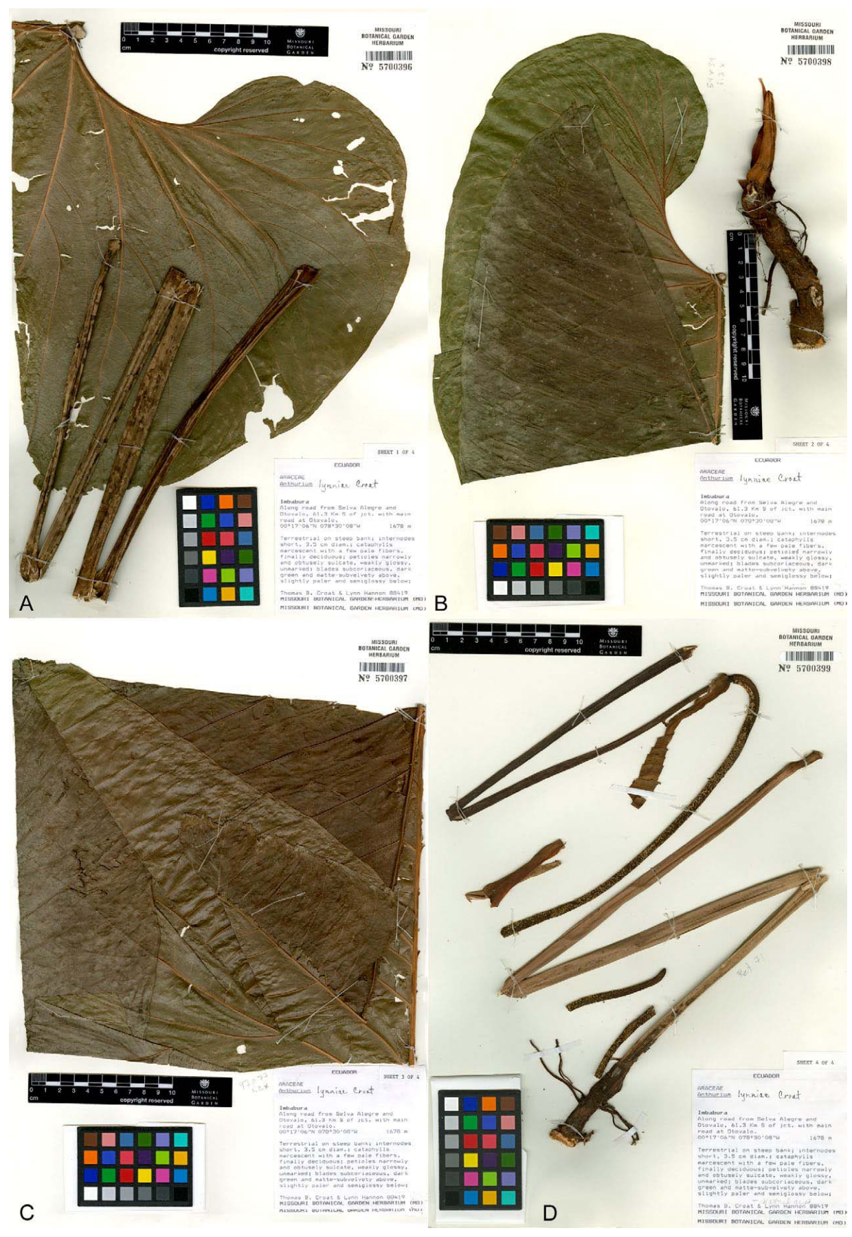
Fig. 3. Anthurium lynniae - the four sheets of the holotype at MO, Croat 88419.