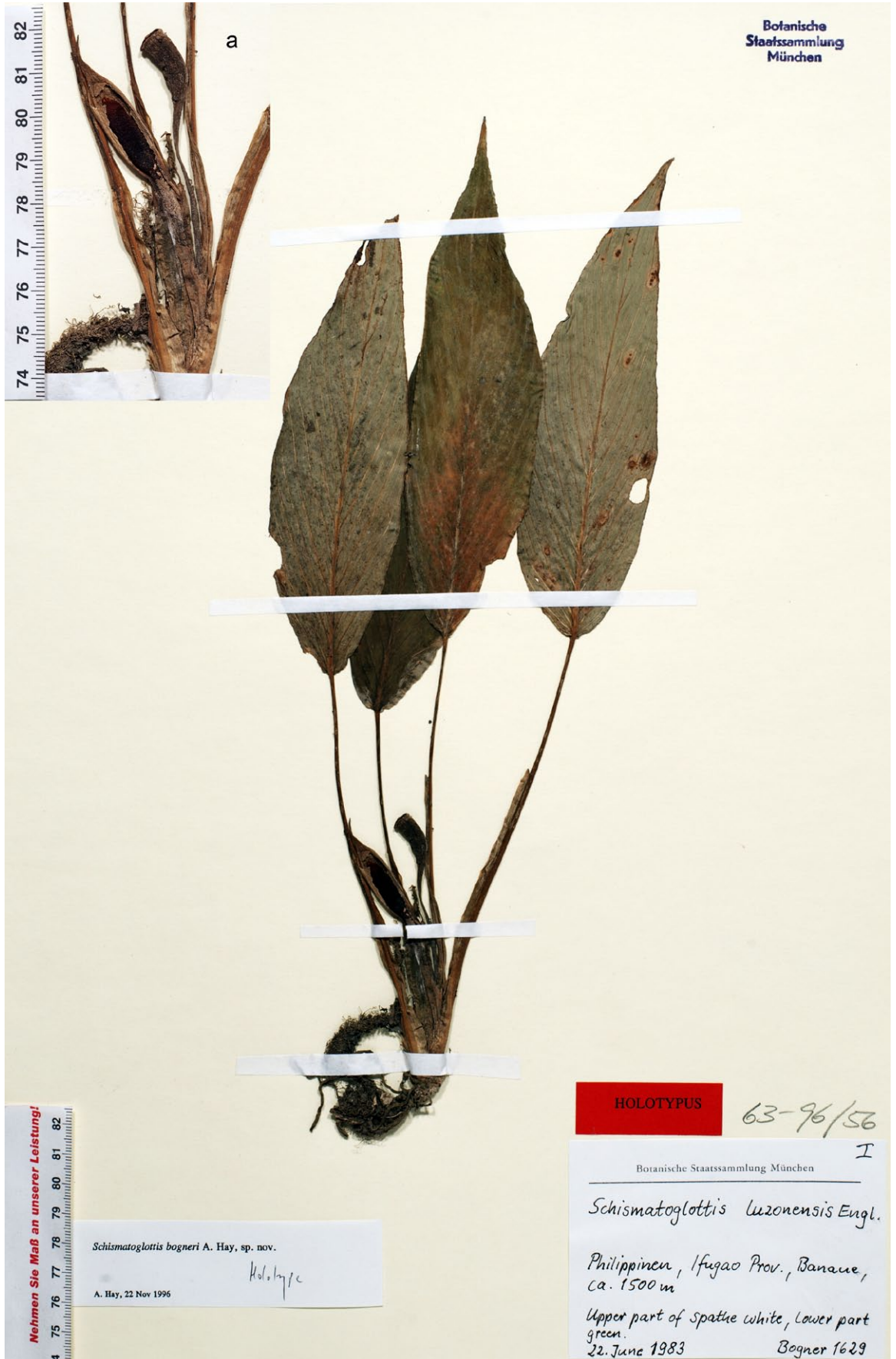
Fig. 3. Schismatoglottis bogneri – holotype Bogner 1629 at M; a: inflorescence enlarged.