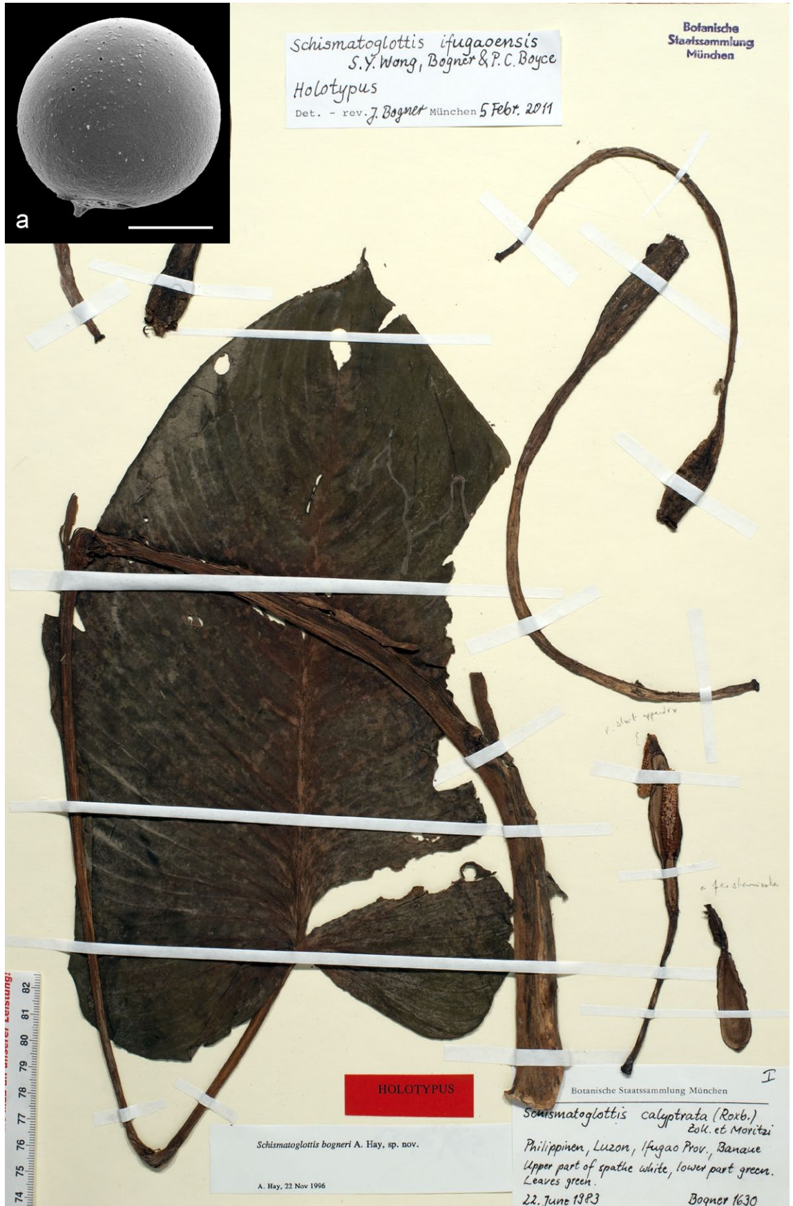
Fig. 2. Schismatoglottis ifugaoensis – holotype Bogner 1630 at M; a: pollen grain. – Photograph by F. Höck; SEM micrograph (a; scale bar = 10 \mu m) by M. Hesse & S. Ulrich.