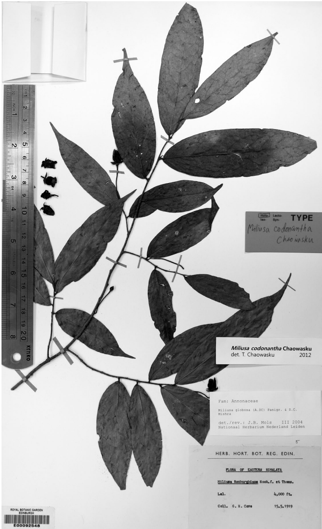
Fig. 1. Holotype of Milium codonantha – Cave (E 00092548).