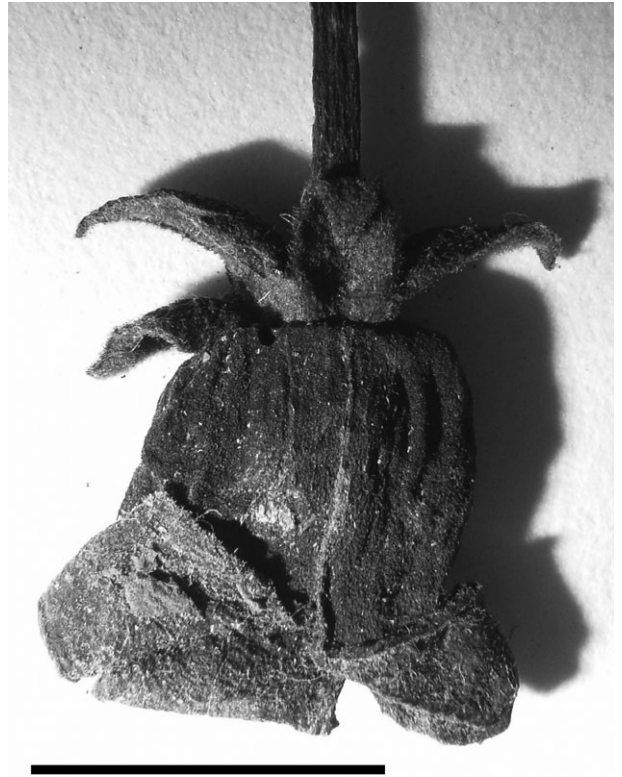
Fig. 3. Miliusa codonantha – enlarged flower, from the isotype. – Scale bar = c. 8 mm.

Miliusa dioeca (Roxb.) Chaowasku & Kessler, comb. nov. ≡ Uvaria dioeca Roxb., Fl. Ind., ed. 1832, 2: 659. 1832 ≡ Phaeanthus dioecus (Roxb.) Kurz in Flora 53: